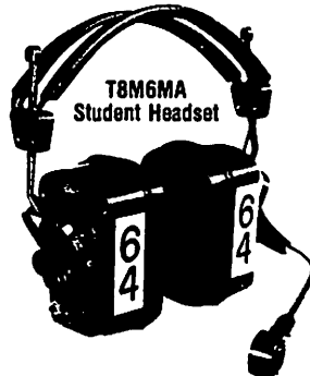
T8M6MA Student Headset

Choice of up to 6 Lesson Channels for up to 64 Students