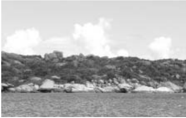
Fallen Jerusalem, BVI: this small island is a possible relocation site for some of the head-started animals on Anegada. This island, with no feral livestock, is well fortified with large rock boulders that offer a degree of protection during heavy storms and hurricanes.

during July 2003 to update the previously published estimate of fewer than 200 remaining in existence.