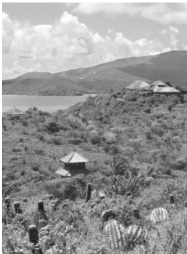
A southwesterly view of Necker Island showing the Balinese Great House (upper right) and the retreat quarters in the pagoda styled structure (foreground). Stout Iguanas were sighted within this area.

thicket. We saw no other iguanas or tail-drags, but did see some scat.