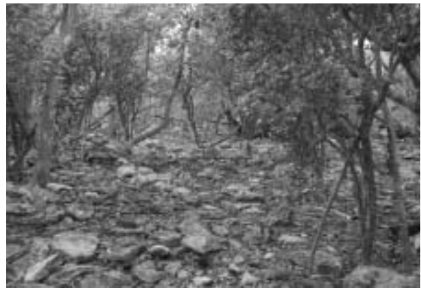
This lightly wooded area near a salt pond on Anegada shows vegetation heavily damaged by feral animals seeking shelter from the sun or areas to rest. Habitat such as this has no chance of recovery while feral animals are allowed to roam free.

The absence of committed, long-term funding continues to impede efforts to secure the species' survival on Anegada. Compounding loss of habitat is ongoing development. Consequently, Stout Iguanas are fighting for survival, suffering simultaneously from habitat degradation and predation on juveniles. Some fear that the upcoming assessment will determine that the Anegada population has declined to critically low numbers and may be functionally extinct in the wild. However, I believe we all shared a warm feeling knowing that the outlook for Stout Iguanas had improved considerably through the efforts of a few very special people.