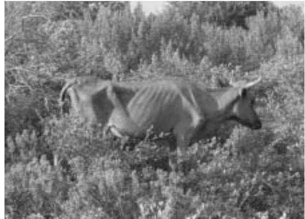
Emaciated cattle are a common sight on Anegada. Although the vegetation appears rich, the plant matter is all secondary growth.