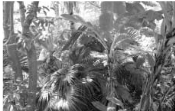
Guana Island's lush habitat clearly demonstrates the positive results of controlling feral animals.

In 1974, Henry and Gloria Jarecki purchased Guana Island. Access to this small island (300 ha) is limited, although it lies only a few kilometers from Tortola. The exclusive Guana Island Club had been constructed in a location designed to