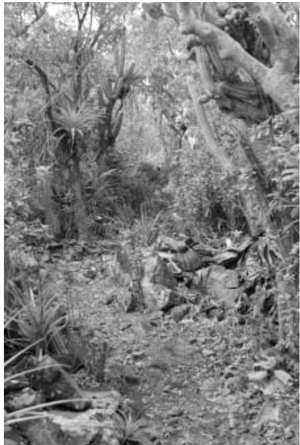
Guana Island's North Trail was created to minimize impact on the habitat, yet it provides hikers with fabulous views of the surrounding natural features. About 300 m beyond this point, an adult Stout Iguana was sighted thundering off into a cactus thicket.