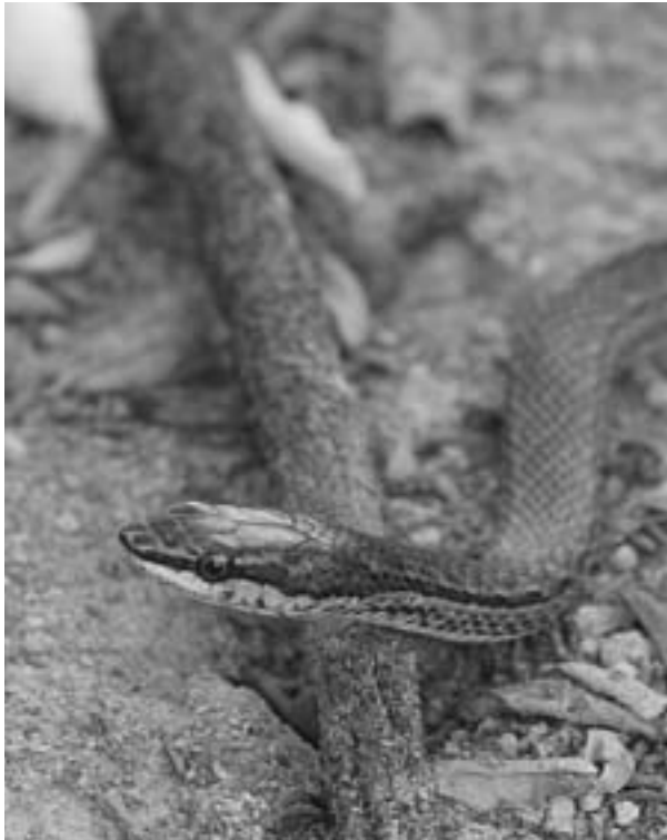
Racers on Necker Island commonly feed on juvenile Stout Iguanas.

Others on the survey team successfully marked several individuals and recorded sightings of hatchlings along the pathways around the maintenance and support facilities. Two Racers also were observed in the same area.