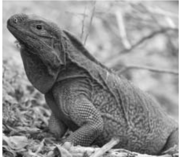
This subadult Stout Iguana was foraging casually along the hillside near the Iguana Trail and allowed us to approach within 3 m. This animal was marked after the photograph was taken.

The next day, Mitchell and I explored the area west of the main facility, accessed from the "Iguana Trail," while another team surveyed the southern area. The weather had improved, but remained partly cloudy and cool compared to typ-