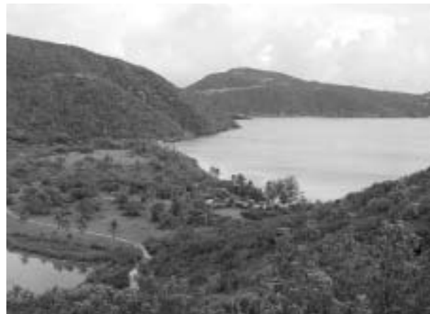
A southerly view of Guana Island from the Club. The salt pond with the six flamingos is located in the lower left and the beach and docking area in the center.

After 14 hours of travel and delays, Guana was a little piece of paradise. At the dock, my gear was loaded into the Club’s pickup and we proceeded up the steep, twisting road to the clubhouse. The Club overlooks the dense tropical vegetation of the island’s southern end, the salt pond — home to the six flamingos, and the white beach of a little cove that merges imperceptibly with the crystalline waters of the Caribbean.