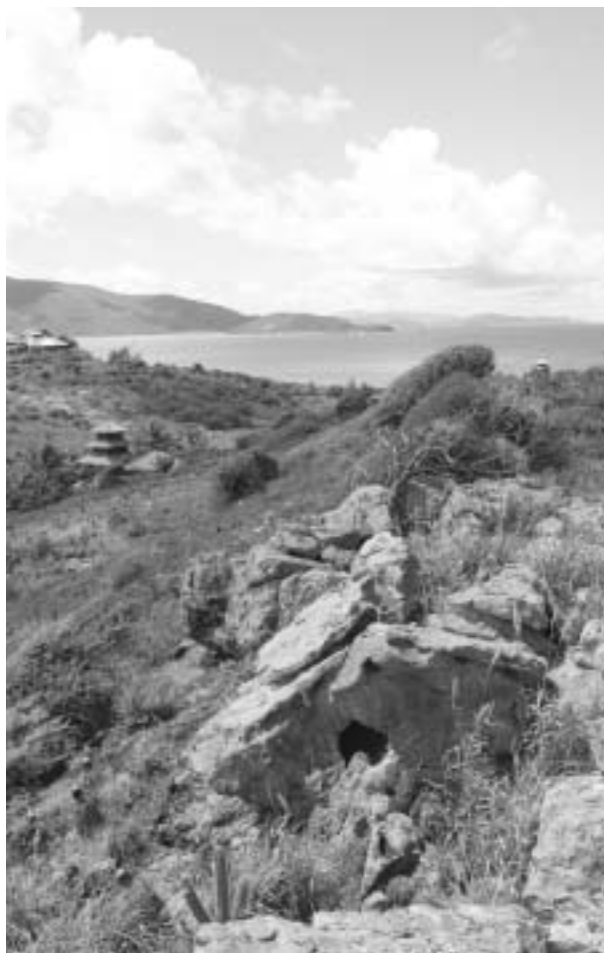
A southerly view from the north side of Necker Island reveals habitat more typical of the region, with rocky terrain and small clusters of hardy trees, low shrubs, and dense stands of cacti.

That afternoon, we focused our attention on the northern section of the island where iguanas were not known to occur. Tail-drags are common on trails in the area south of North Beach, but they abruptly disappear to the north of a line roughly parallel with Crab Cove. The trail eventually splits into two routes, and Mitchell and I separated to cover more ground. About halfway between Crab Cove and Chicken Rock Steps, I observed one large, unmarked adult, who, unlike others we had observed, responded to the intrusion by quickly thundering off into a cactus