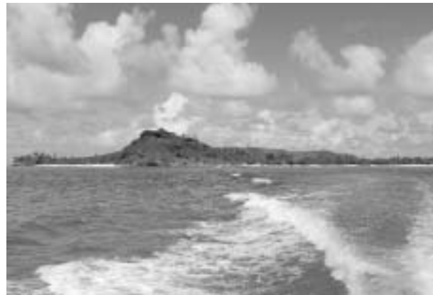
Necker Island, BVI: high atop the island is the Balinese Great House.

Necker Island, like Guana, is privately owned and exclusive, with a single luxurious resort, the Balinese Great House, situated on the highest point and overlooking the coral reef-studded waters of the Caribbean. The island supports dense tropical vegetation, composed of both native and non-native plants and enhanced by irrigation. The other half of the island is more typical of the region, with rocky terrain and small clusters of hardy trees, low shrubs, and dense stands of cacti. Designated a bird sanctuary, Necker is home to pelicans, doves, and hummingbirds.