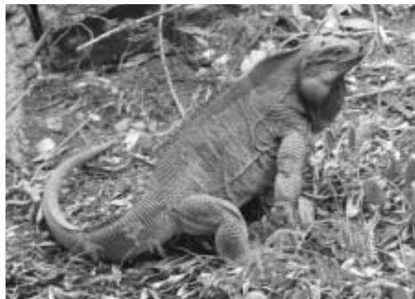
"Hambone," one of the founding iguanas on Guana Island, frequents the vicinity of the Club.