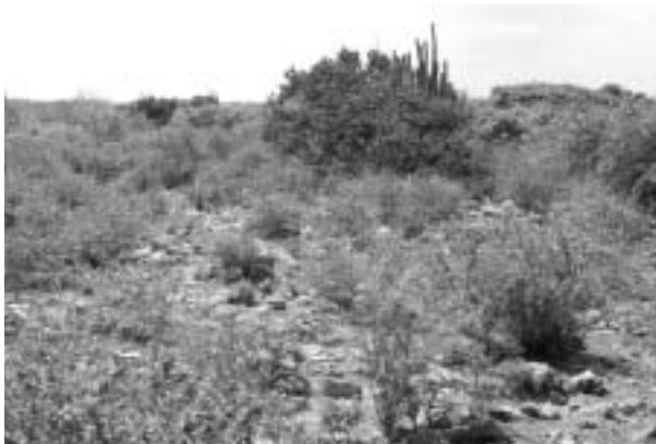
Heavily degraded habitat on the East End of Anegada near Crasy Pond once supported subpopulations of Stout Iguanas. In 1984, the DOA converted a deep freshwater limestone solution hole called "The Fountain" to an above-ground watering hole, providing a permanent water source for feral livestock. Recent surveys in and around the East End suggest that Stout Iguanas have been extirpated.

Controlling livestock or feral predators on Anegada is nearly impossible due to the island's remote location and the tens of thousands of dollars that would be required. So, in 1980, in light of the obviously rapid and apparently unchecked decline of the iguana population during the previous decade, Lazell and his colleagues believed that the species was headed for extinction — unless something was done immediately. Because a solution on Anegada was not feasible and Anegada was the only place where the species still existed, the obvious recourse was to establish a second population — but where and by what means?