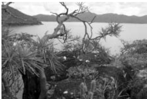
Practically any view from Guana Island is breathtaking.

In the interim, he continued working on a plan that would establish a second population of Stout Iguanas while promoting other conservation and restoration goals in the British Virgin Islands. An idea for an exchange of species came with the realization that the vast salt ponds of Anegada, which had supported large colonies of Greater Flamingos ( Phoenicopterus ruber ) in the 19 th century, could be restored if funds could be found. The beauty of this plan was the mutual benefits to all parties involved: the British Virgin Islands and the residents of Anegada would benefit from the reintroduction of flamingos and, at the same time, the second population would provide some assurance for the long-term survival of Stout Iguanas.