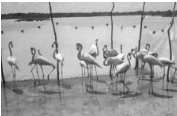
Greater Flamingos ( Phoenicopterus ruber ) in holding pens shortly after their arrival on Anegada.

Lazell next set out to complete the species exchange plan. The Bermuda Aquarium, Museum, and Zoo (BAMZ) had both captive-bred and wild-stock flamingos and agreed to donate a number sufficient for establishing a population. Numi Mitchell (TCA) arranged the international transfer of the birds (BVI Agriculture and Fisheries Permit and veterinary certification of the birds' health, especially Newcastle's Disease). Numi and Glenn Mitchell (TCA) and James Conyers (BAMZ) transported the birds by jet from Bermuda to Tortola and then by boat to Anegada. The flamingos initially were released into a net holding pen at the salt ponds, allowing them to recuperate and