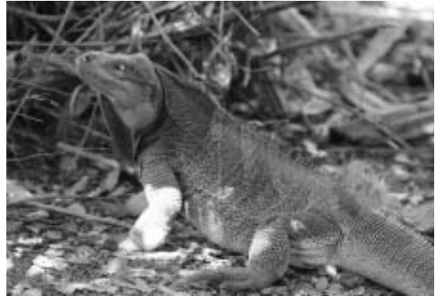
One of the four founding Stout Iguanas on Necker Island (shown near the feeding area) was hiding behind a clump of debris, straining to see if his morning serving had arrived.

In stark contrast to the boisterous excitement that characterized the boat ride to Necker, we quietly sought a comfortable spot for the return trip. Although tired from the day's hard work in blaz-