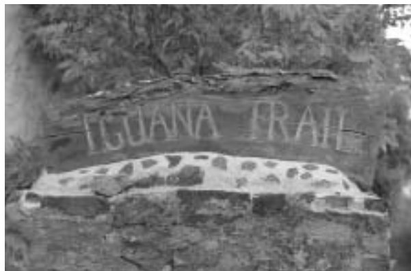
Iguana Trail: a path originating at the lower Guana Club level and leading leisurely to the salt pond and beach below.