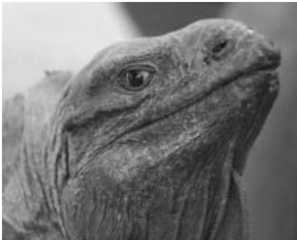
This Anegada Iguana was estimated to be over 20 years old.