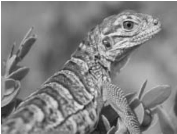
A hatchling Stout Iguana on Guana Island seeks refuge among the branches of a bush, reducing the likelihood of falling prey to a Racer, but increasing the chances of being spotted by a Kestrel.