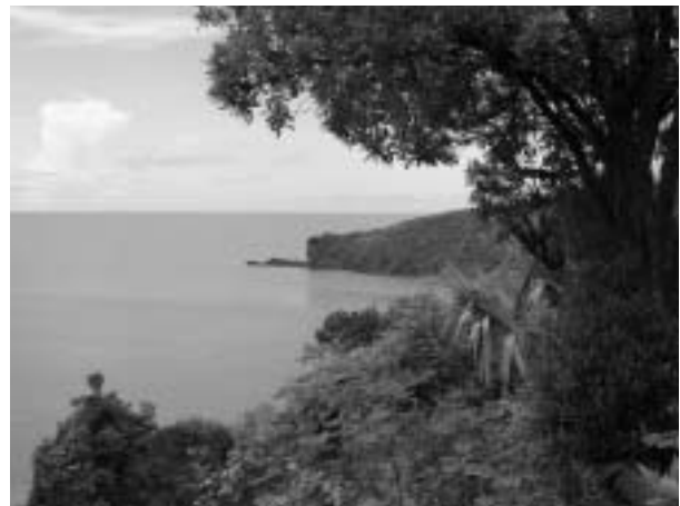
A Guana Island view to the north showcases its rich flora.

Essentially all possible relocation sites in the British Virgin Islands were equally infested with feral predators and goats. However, in 1932, Chapman Grant had noted the presence of iguanas on Guana Island and had identified the species as Iguana iguana (Common or Green Iguana), but the presence of that species was never confirmed and none has been seen since. Sometime in the mid-1930s, Louis Bigelow, then owner of Guana Island, had extirpated goats and had banned woodcutting for making charcoal. This had left only a couple of domesticated burros and free-ranging sheep on the island. The latter are far less destructive than goats.