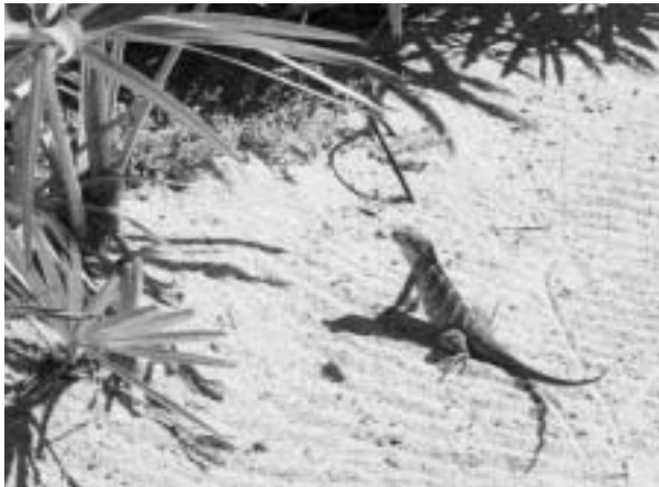
A Stout Iguana hatchling on Necker Island basking on the light sand walkway that leads to the beach. Small tail drags were numerous along these walkways.

In October 1995, four hatchlings were taken to Necker and head-started for a year before being released. During that time, one female escaped, but was seen later and appeared to be gravid. In 2000, Lazell reported seeing the first hatchling and subsequent reports from the island indicated that Stout Iguana hatchlings were abundant. Although the population is still in its infancy, during the October 2002 population on Necker, founding stock, young adults, and hatchlings were recorded.