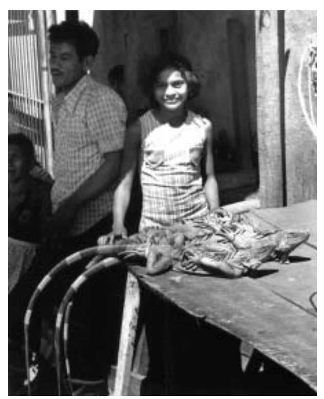
A young iguana vendor and her merchandise (Chinandega, Nicaragua; February 1976).

Iguanas during the nesting season. The hunter would move stealthily along a stream, scanning the terrain ahead for signs of nesting activity. Several females might be digging their nesting burrows in a sand bank, and some might have their forequarters in a hole so that they could not see danger approaching. At a signal from the hunter, the dog would race ahead and might catch a female before she could escape from the burrow or outrun her before she could reach the safety of a tree. Females bearing a heavy burden of eggs were relatively slow runners. The dogs were trained not to injure the lizards.