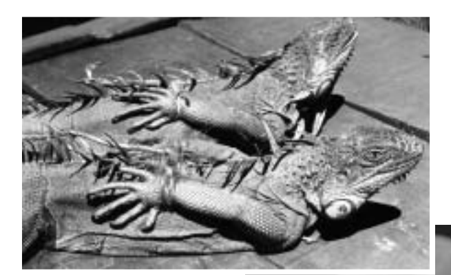
Tethered Green Iguanas at the Chinandega, Nicaragua market (February 1976).

Male and female ctenosaurs with their mouths sewn shut (Nicaragua, February 1976).