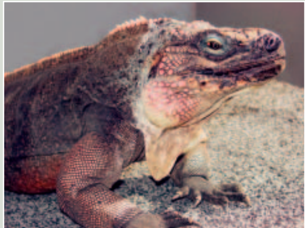
Iguana management and husbandry. See article on page 129.