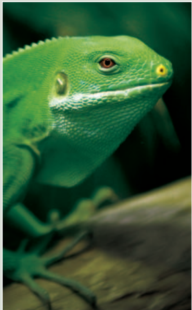
Fijian Banded Iguana ( Brachylopus fasciatus ). See