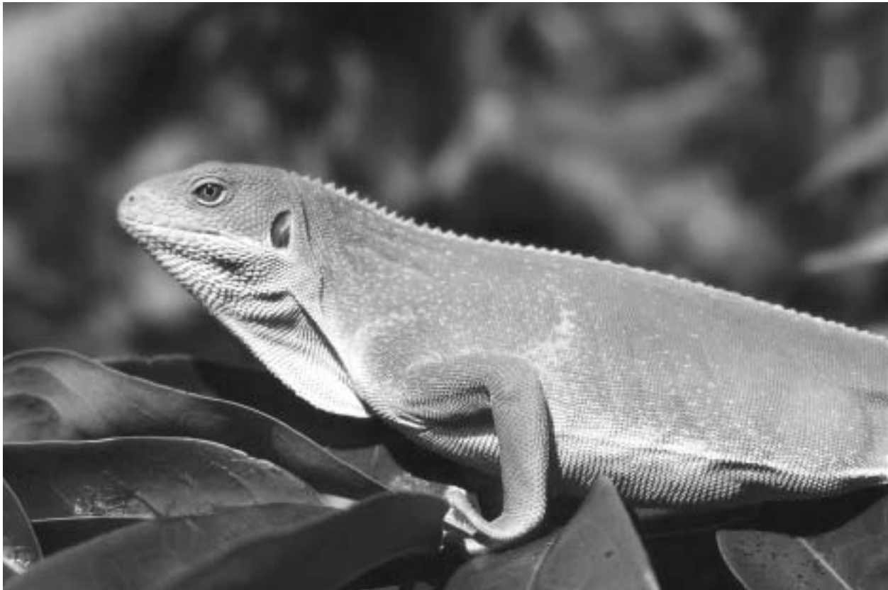
A gravid female Banded Iguana from the large inhabited island of Kadavu, where occasional sightings still occur.

At the landing site a few meters from the shore of Aiwa Lailai, we all jumped overboard on the orders of our boatman. Two of us held the bucking and tossing boat in chest deep, choppy water, while the other two quickly carried our gear ashore and tossed it on top of the undercut, two- to three-meter high limestone cliff that encircles the island. This included a large plastic barrel of fresh water, as both Aiwa Islands lack fresh surface water. As the last bag of camping gear was removed, the boatman jumped back in, started the motor and disappeared towards the fringing reef.