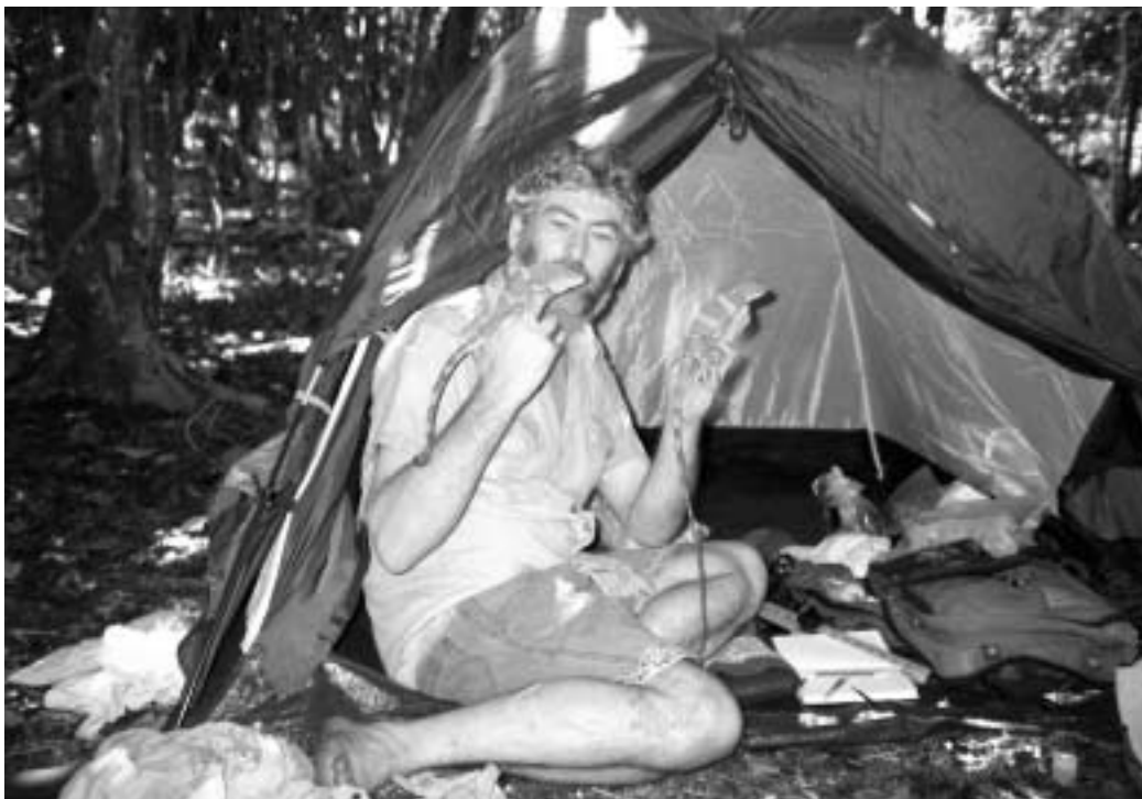
The author with a pair of Banded Iguanas captured during night transects on Aiwa Lailai.