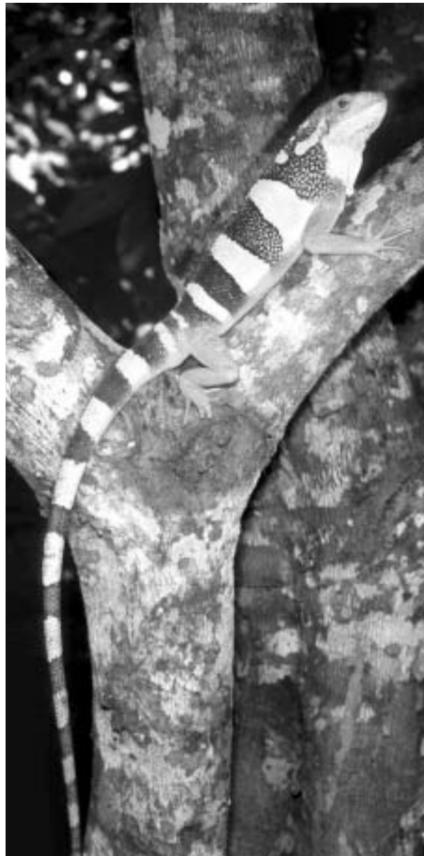
A male Banded Iguana from the island of Ovalau.

In September 2002, National Trust Crested Iguana Sanctuary ranger, Pita Biciloa, and I flew to the large inhabited island of Lakeba, 300 km east