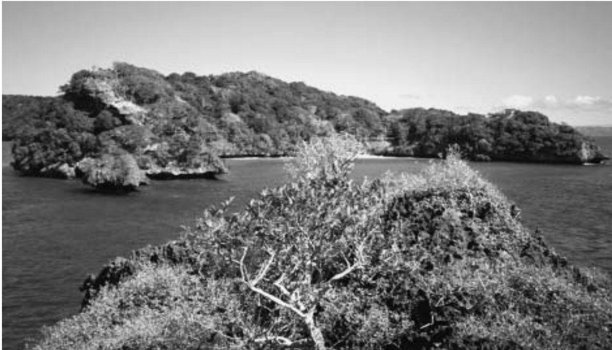
The limestone island of Aiwa Levu, seen from the neighboring island of Aiwa Lailai.

He promised to return in three days — if the ocean was calm. If not, he smiled as he left, we could survive by eating the plentiful vokai (iguanas) and goats.