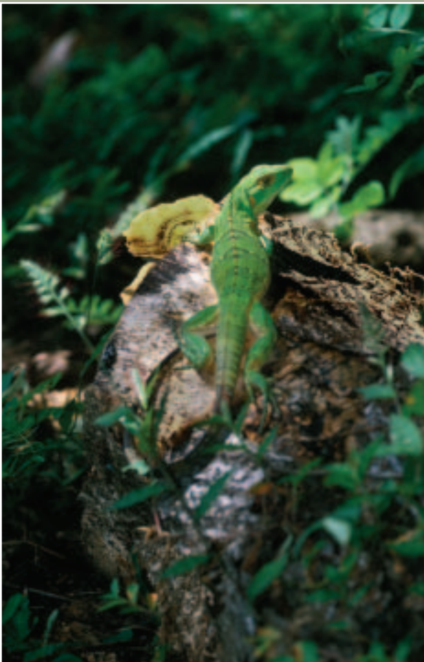
Juvenile Black Iguana ( Ctenosaura similis) from Parque Nacional Santa Rosa, Costa Rica (see article on p. 16).