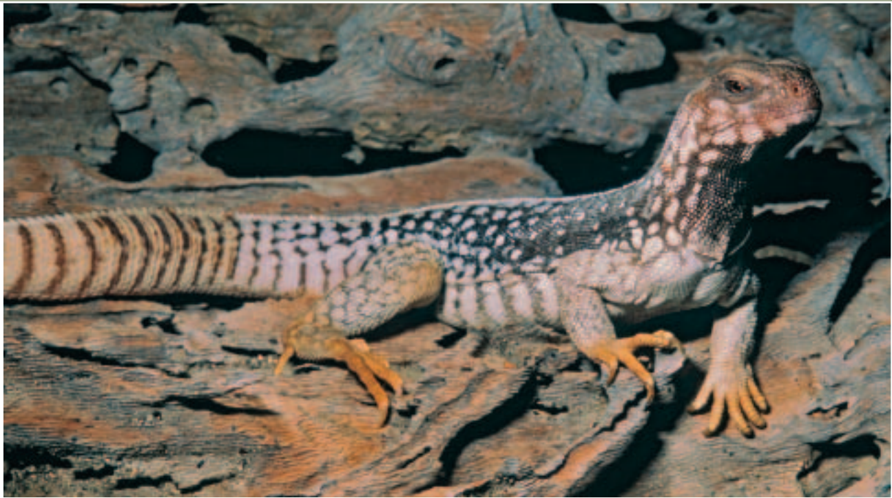
Santa Catalina Island Desert Iguana ( Dipsosaurus catalinensis ): An evolutionary experiment in progress (see article on p. 2).