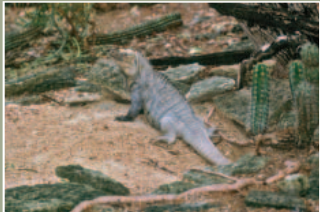
Ricord's Iguana ( Cyclura ricordii) from Parque Nacional Isla Cabritos, Dominican Republic (see related story on p. 8).