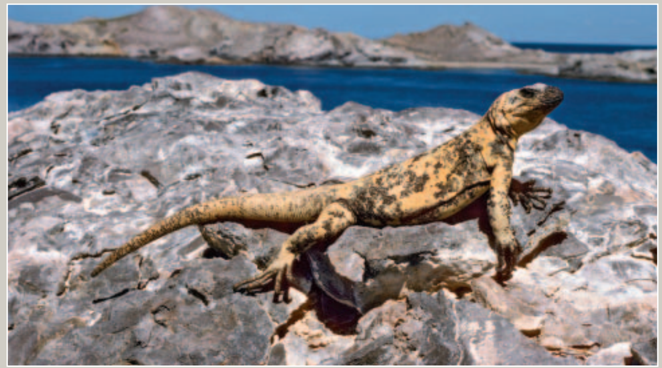
Sauromalus varius, Isla Roca Lobos, Baja California. This population is located on a small islet in the San Lorenzo group off Baja California. It is believed to be introduced (see article on p. 78).