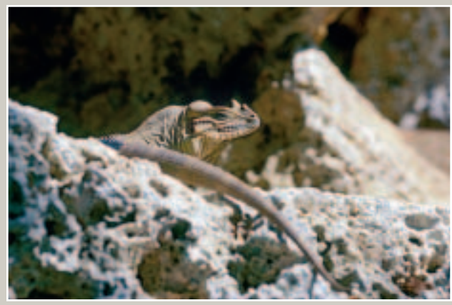
Mona Island Rhinoceros Iguana, Cyclura cornuta stejnegeri (see article on p. 98).