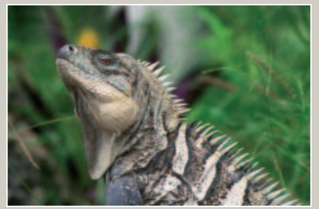
Ricord's Iguana, Cyclura ricordii, on Isla Cabritos, Dominican Republic (see report on recent survey, p. 88).