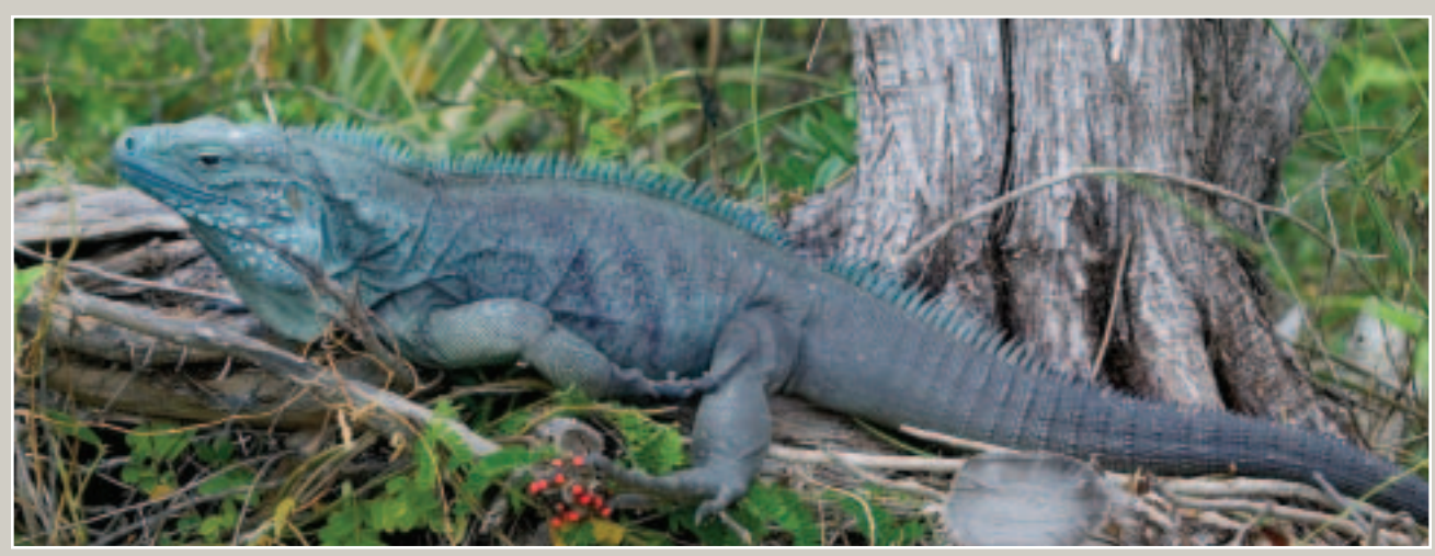
Cyclura lewisi (Species and Subspecies: What Do They Mean and Why Should We Care?, p. 108).