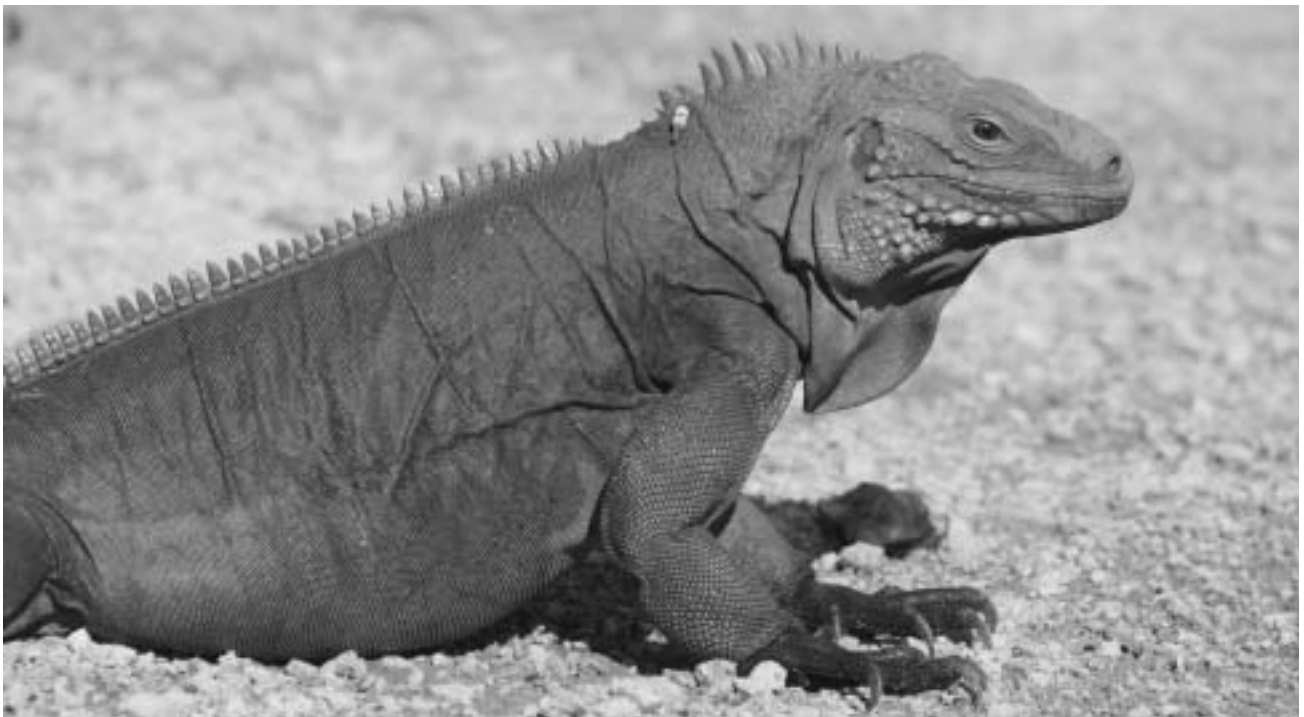
Adult female C. lewisi : juvenile markings have been lost.