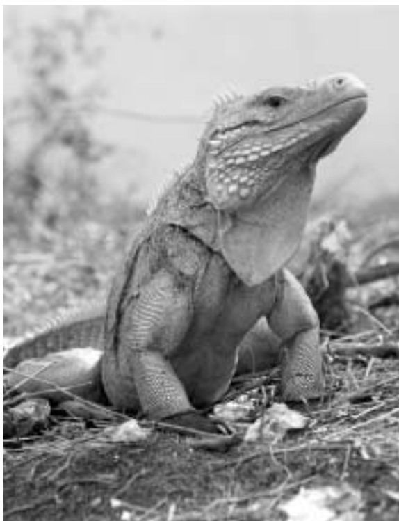
Potential founder male, Hal, was until recently in illegal captivity and is now recovering from a decade of chronic malnutrition. He mated in 2003 and 2004, but so far remains infertile.