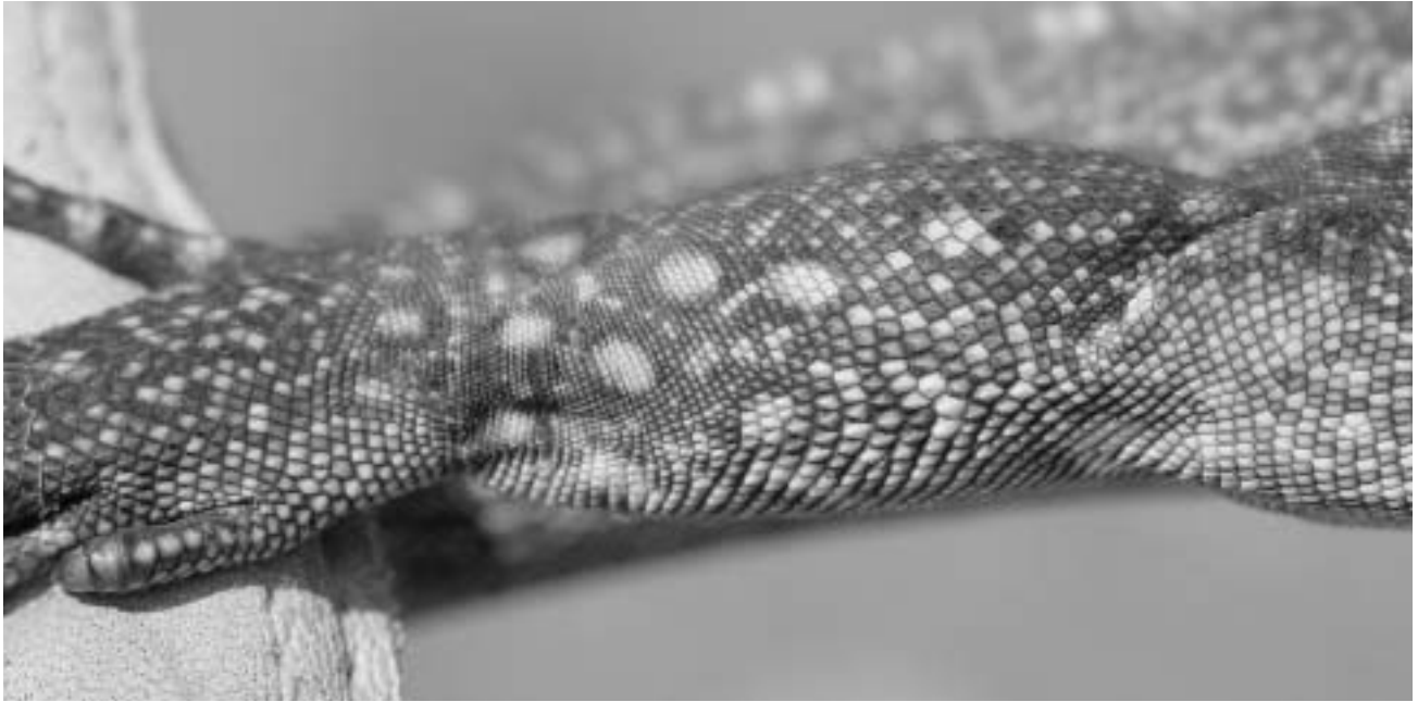
Spots on the legs, still evident at one year, usually disappear completely as the animal ages.

By one year of age, the bluish gray and gray base colors have become clear blue and the chevrons have begun to erode, narrowing and breaking up into spots on the lower flanks, where they may become circles exposing a center of blue. The back is