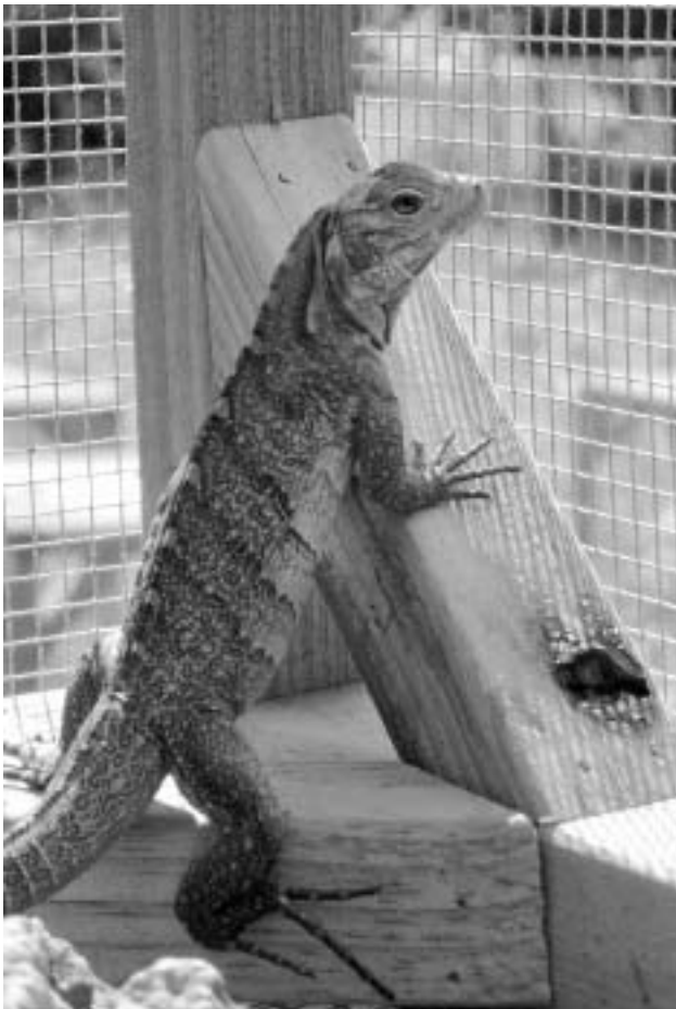
Newly hatched Cyclura lewisi : at this age the hatchling is still consuming its yolk sac and has not started feeding.

Along the back, the chevrons connect to an alternating pattern of near-black and pale cream spots down the middorsal line, marking where the dorsal crest will emerge. The cream spots begin as a single pale nuchal crest scale between the first and second chevrons, followed by three progressively larger spots to the third chevron, two large spots to the fourth, and a single spot between subsequent chevrons. Black scales between these spots