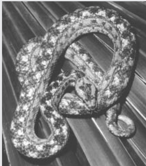
Adult Grand Cayman Ground Boa, Tropidophis caymanensis .

Species of Tropidophis are relatively broadly distributed in the West Indies and South America, but they are secretive. Consequently, many are not well-represented in museum collections and their taxonomy has been poorly understood. Previous