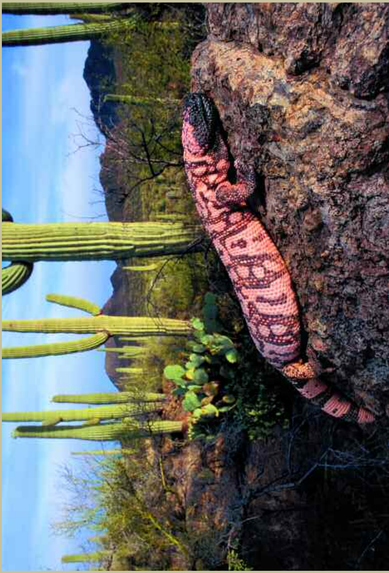
Gila Monsters ( Heloderma suspectum ) are rare residents of the Sweetwater Preserve (see article on p. 14).