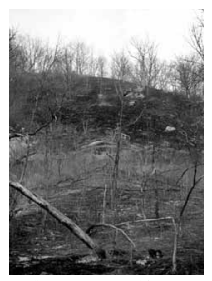
A controlled burn: Without periodic burns and selective cutting, most bluff prairies would become overgrown with Red Cedar and Buckthorn, eliminating rare prairie plants and degrading rattlesnake habitat.

Additionally, we had cut ourselves off from a lot of information and help. We met several snake hunters from the bounty days, who told us about other dens and things they had seen. Likewise, they were surprised by many of the things we were discovering. Most of their work was done at the dens or nearby ledges and rocks. Rattlesnakes hunting in the woods are so scattered and so well camouflaged that these hunters, despite years of experience, knew almost nothing about the biggest parts of a rattlesnake's life. One man first said that the project was a waste of time because "lots of Timbers" were still around. A week later, he mentioned that he had been talking with some friends, and