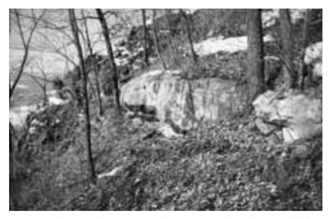
Due to its slope and exposure to the winter sun, this den is mostly free of snow even in February.