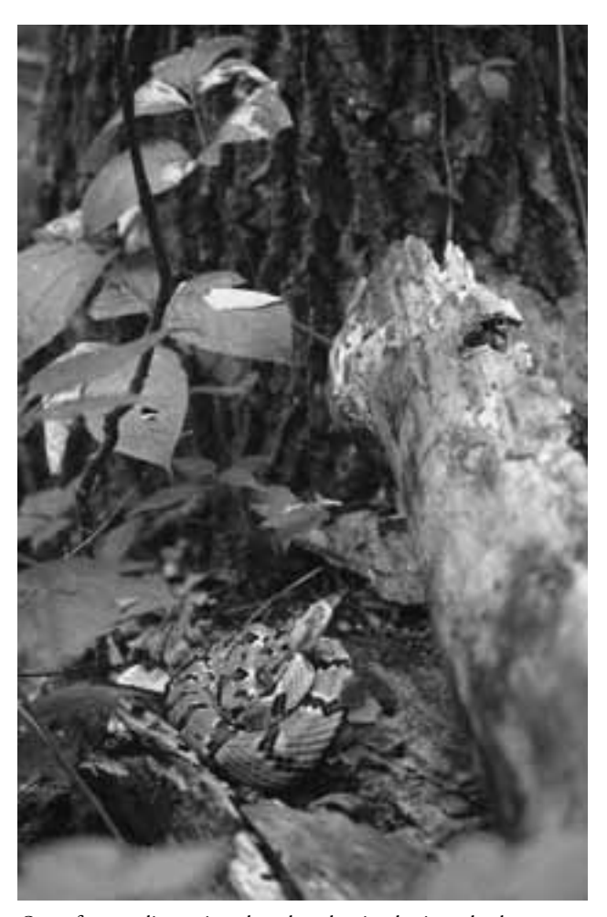
One of our radio-equipped rattlesnakes in classic ambush posture. Having picked up the odor of a chipmunk trail along the top of the log, the snake settles in, ready to strike as the rodent passes by. Snakes will maintain this position for days at a time.

that, like their cousins in the northern reaches of the Appalachians, they have a very short activity period. Our snakes began emerging from dens in late April and May, although we have occasionally seen snakes out as early as 4 April or still in the