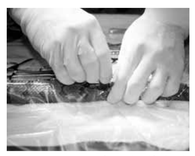
Implanting a transmitter into one of our anesthetized females at the University of Wisconsin Veterinary Hospital.

Although we do not know what the inside of a Timber Rattlesnake den looks like, a recent observation does lead to interesting speculation. Might Timber Rattlesnakes hibernate in pools of water found in the rocky recesses of their dens? During this past winter (2004–2005), we had to bring two large males into the lab. During the month of November, when they would normally be moving deeper into their dens, both animals spent a considerable amount of effort trying to push their way through the bottoms of their drinking bowls. This behavior had not been seen in two previous months of captivity. Could they have been trying to hibernate underwater?