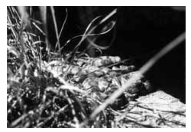
A clutch of neonates lies basking at the edge of the birth rock. The snakes are less than a day old, and have not yet shed.

While the females basked in the prairie, the big males moved off the bluff into the wooded ravines to hunt. One snake stayed in the ravines, while the "Swamp Fox" moved on into the creek bottom. Both snakes preferred cooler, more shaded conditions than the females, and, rather than rocks, they were most often found touching or close to logs.