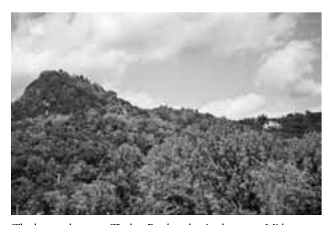
The largest threats to Timber Rattlesnakes in the upper Midwest are loss of bluff prairie habitat and development. Notice the thick growth of Red Cedar overgrowing prairie on the point. In the last two years, five roads and over one hundred vacation home lots have been cut along the bluff tops within a mile of our study site.

was to amass the basic ecological and behavioral data on Wisconsin populations. These would be necessary for the devel-