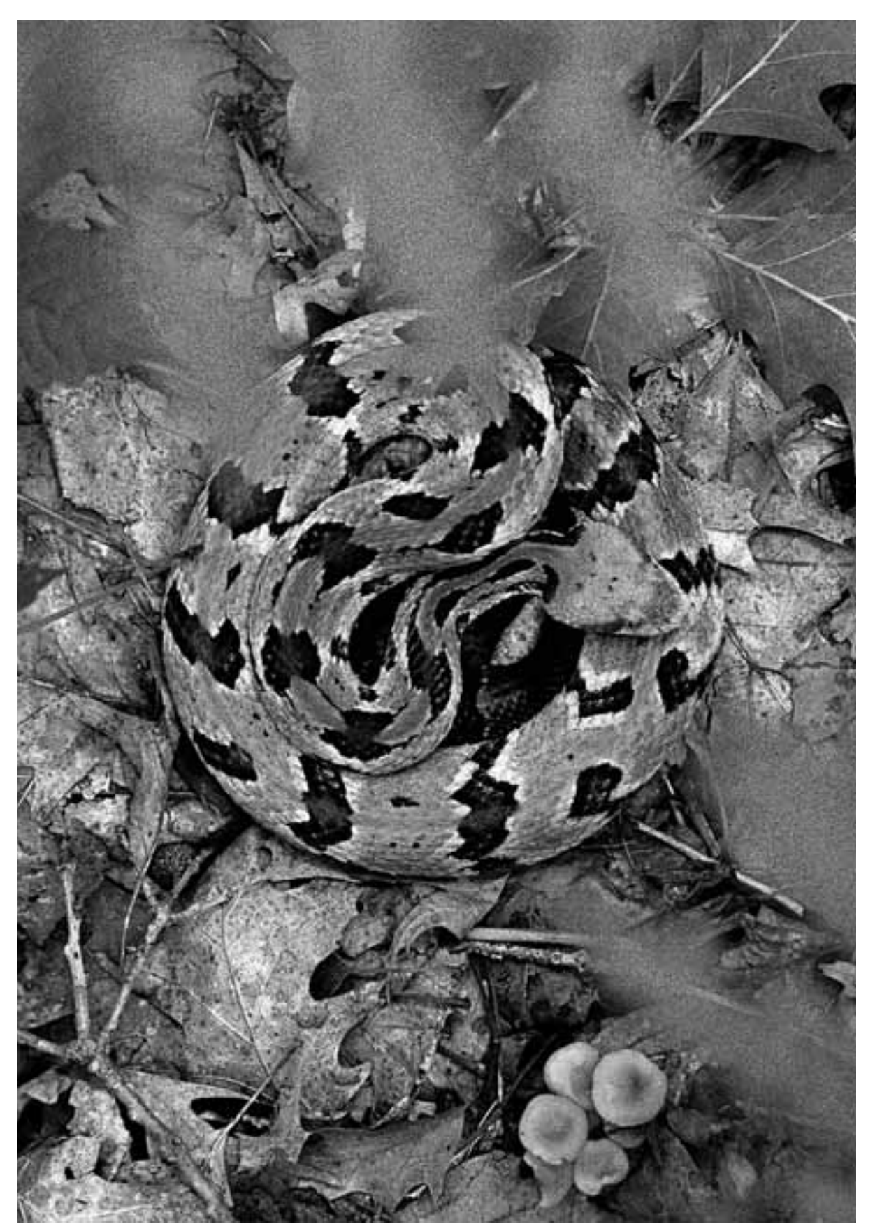
Timber Rattlesnakes (Crotalus horridus) reach the northernmost extent of their range on the bluff prairies in Wisconsin.