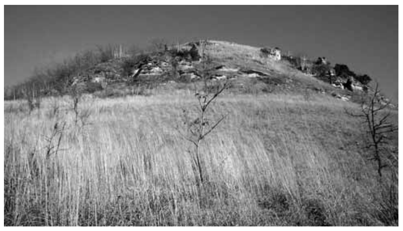
Open bluff prairies are classic snake-hunter favorites. These prairies are not only critical as den and birthing locations, but reservoirs of rare prairie plants as well.