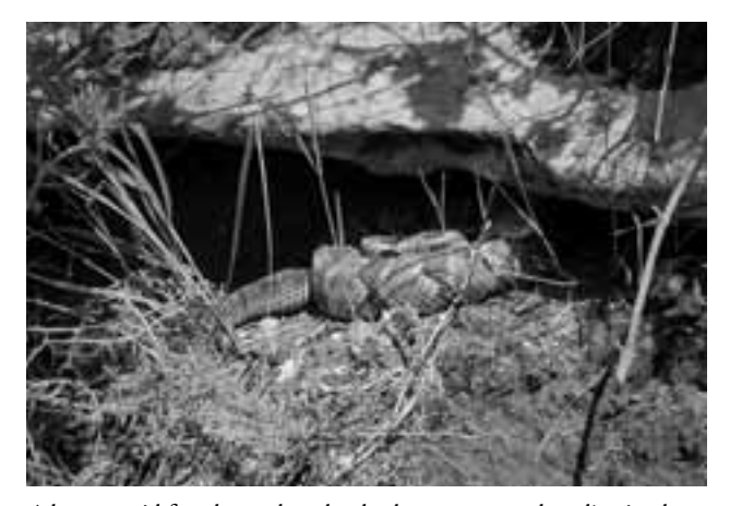
A large gravid female regulates her body temperature by adjusting how much of her body is exposed to the sun.