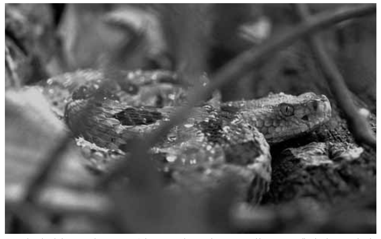
A juvenile rattlesnake lying exposed in a rainstorm. Only extreme conditions, such as an unseasonable snowstorm, will make a hunting rattlesnake take cover.

den in mid-June. Rattlesnakes begin entering the dens in September or as late as 19 October. Oddly, Timber Rattlesnakes leave the den weeks later and enter the den weeks before Black Ratsnakes ( Elaphe obsoleta ) and Blue Racers ( Coluber constrictor ) using the same dens. Rattlers moved as much as a mile or mile and a half away from the dens. We found that, on our original study site, an extensive tract of relatively undisturbed state land, the snakes preferred hunting in oak woodland or swamp woodland habitats, and avoided entering agricultural fields or crossing highways. However, in other locations, on private land in areas closer to humans, Timbers utilized fields and even backyards, where they sometimes came to grief.