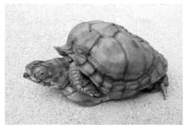
A malformed Three-toed Box Turtle ( Terrapene carolina triunguis ) suffered from an insufficient diet and a lack of ultraviolet light.

We have not truly domesticated any reptile or amphibian; I will therefore conclude that CB animals are as wild as their WC counterparts. CB reptiles and amphibians may be more or less acclimated to life near or with humans; they may or may not display aggressive behaviors to territorial intruders or other encounters and experiences. They may or may not make 'good' wild animals since, as often as not, breeders keep alive every hatchling regardless of fitness. To declare an animal unable to withstand the pressure of a life in its wild habitat does not make it any less wild. The individual animal would have simply met demise early in its natural life.