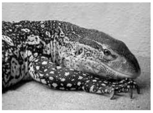
This Ornate Monitor ( Varanus ornatus ) is now deceased. An animal that can attain a length of two meters, has a naturally aggressive disposition, and requires a largely aquatic habitat is a questionable choice as a pet for most people.

the pet trade. We can shut down the introduction of new individuals and new species of reptile and amphibians into the pet trade — and greatly reduce suffering and death. These ideals should inform a true conservation ethic.