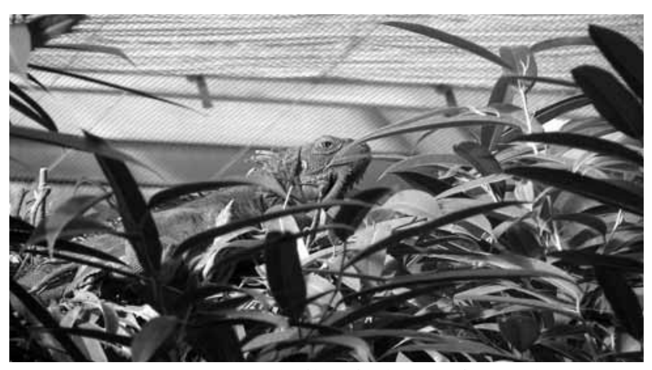
Rosie, a Green Iguana (Iguana iguana), now a permanent resident of the Butterfly Pavilion (www.butterflies.org), is seen here atop her tree bower.

Let me propose a less than radical notion toward reptiles and amphibians: Acknowledge them as the wild animals they are and operate as their conservation advocates and wardens, keeping them and their needed ecosystems protected in our world — and out of all living rooms. Reptiles and amphibians are not appropriate personal pets, any more than we would reasonably consider mountain lions, hippos, or ostriches. If they were larger, vocal, and able to harm us more easily and more often, I suspect they would no longer be such a popular part of