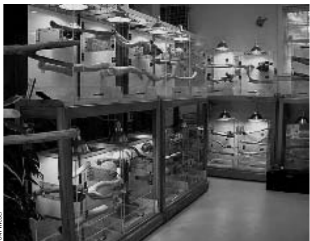
Facility for housing Emerald Tree Boas showing vented enclosures, external lights, and pullout trays for easy maintenance.