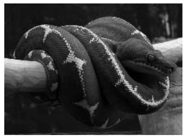
Adult male Corallus caninus showing the slit pupils associated with nocturnal activity, the heat-sensitive pits that locate prey and direct strikes even in the absence of light, and the characteristic posture assumed by Emerald Tree Boas.

Whereas aesthetic considerations will influence the selection of cage furnishings to some degree, the most ergonomically efficient minimalist designs require less of virtually everything. Focusing on the inhabitant as the primary attraction and minimizing the number of decorative items will minimize maintenance time and allow for greater budget flexibility, especially when considering larger colonies.