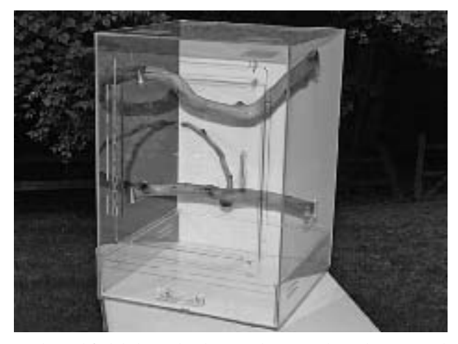
Easily modified, lightweight plastic enclosures with perches at several heights facilitate maintenance of proper temperature and humidity.