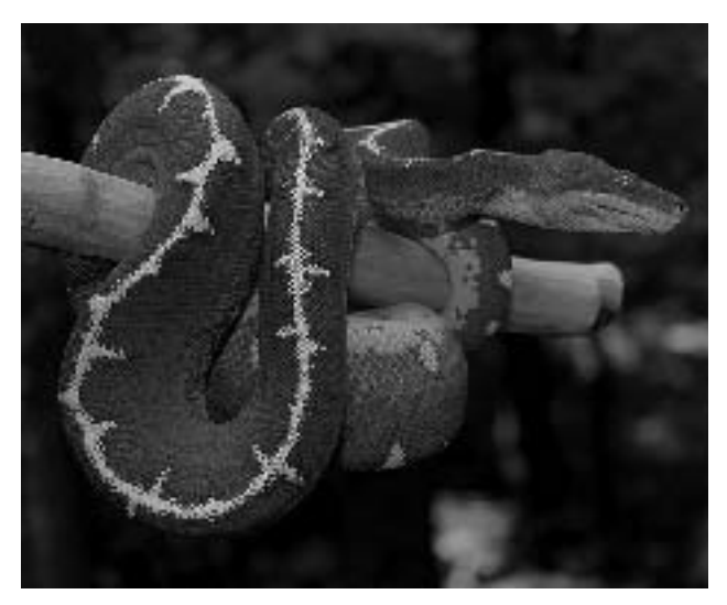
Adult male Corallus caninus demonstrating the color and "personality" that causes these snakes to be so prized by hobbyists.

Depending on the nature of the facility, minimalist habitats within environmentally controlled rooms may consist of as little as two perches and a water source. Although such setups have proven ideal and are commonly parts of larger collections, the majority of herpetoculturists employ environmentally independent self-contained habitats. Such units require additional hardware to achieve and sustain the continuous levels of temperature and humidity necessary to maintain Neotropical