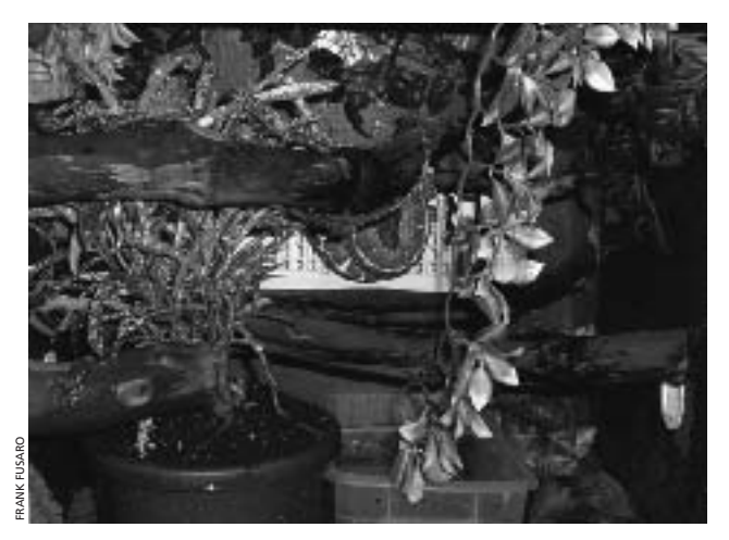
A naturalistic enclosure for housing an Emerald Tree Boa; note the low air intake, high vent, and large water bowl.