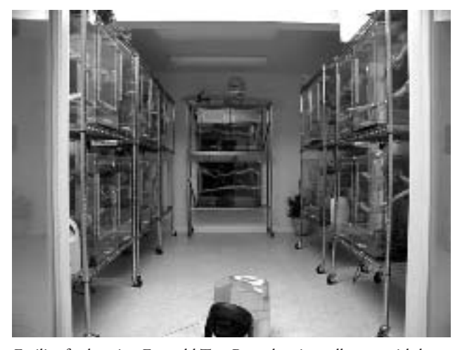
Facility for housing Emerald Tree Boas showing tall cages with large openings that allow ready access for maintenance. Note the humidifier in the foreground; controlling the environment of an entire room precludes the duplication of control mechanisms for each enclosure.

refined techniques for the maintenance of precise atmospheric conditions in greenhouses, and these same strategies can be successfully applied to housing C. caninus .