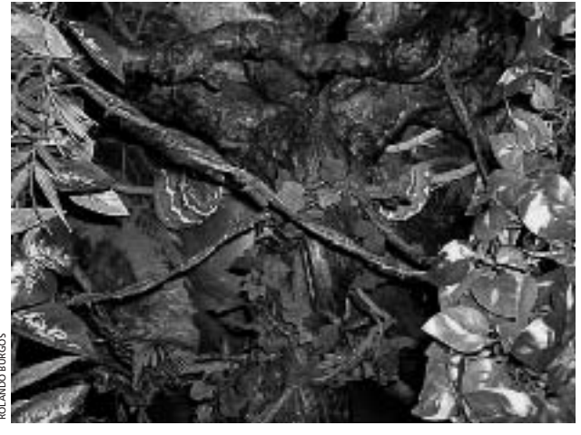
Naturalistic enclosures can be striking, but the inhabitant is often less evident than in minimalist enclosures.