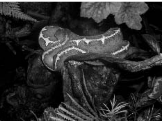
Naturalistic enclosures can provide a sense of the interactions that occur between a tropical snake and its natural environment.