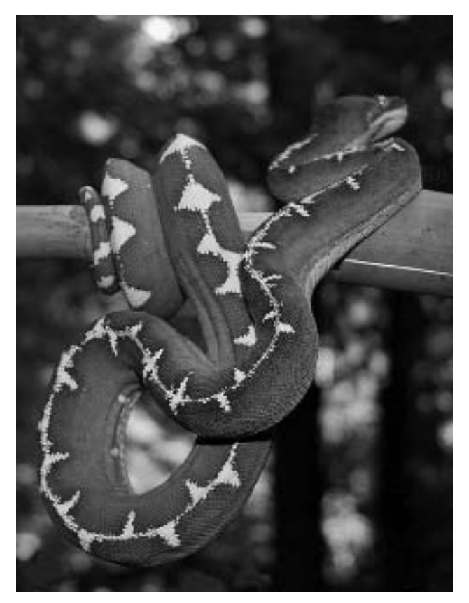
The extent, continuity, and pattern of white markings in Corallus can inus vary considerably in different parts of the species' natural range (see also Iguana 12:2–7).

In nature, Emeralds are exclusively arboreal primary rainforest dwellers that thrive within a relatively narrow range of conditions. Until recently, this combination was quite challenging to recreate within a captive environment. Maintaining moderate ambient heat, high relative humidity (RH), and continuous air circulation was difficult enough, but attempting to balance these elements to within the specifications of a Neotropical rainforest habitat have traditionally proven all but impossible for the average herpetoculturist. As a result, even today, appropriate captive habitats are still relatively uncommon. Interestingly, however, long before the advent of hi-tech gadgetry, horticulturists had