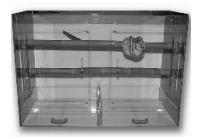
Minimalist enclosures appropriately emphasize the inhabitant.