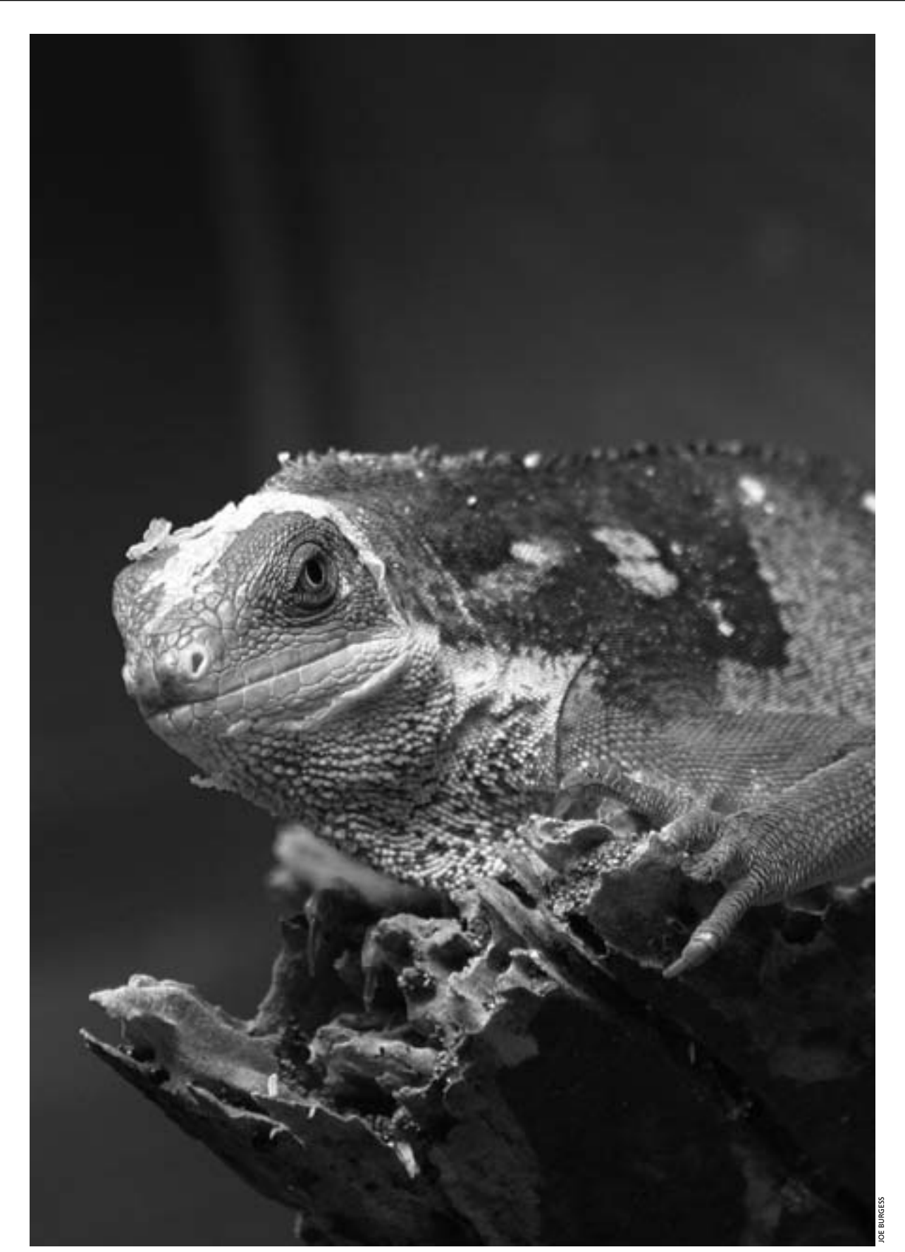
Adult Fijian Crested Iguana (Brachylophus vitiensis).