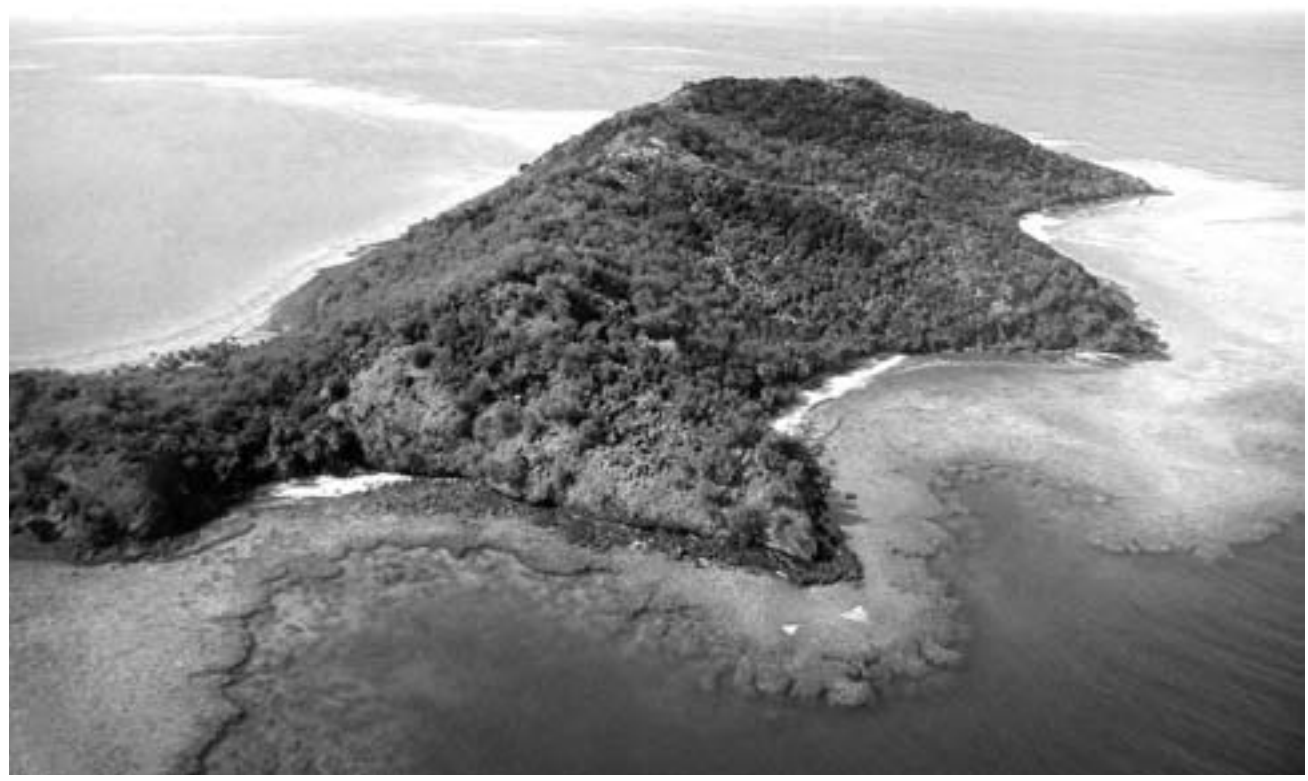
The Yadua Taba Crested Iguana sanctuary island is surrounded by coral reefs.

Luckily the high tide allowed us to motor all the way to the beach on Yadua Taba and we quickly began unloading and moving the huge mound of gear to our campsite just inside the for-