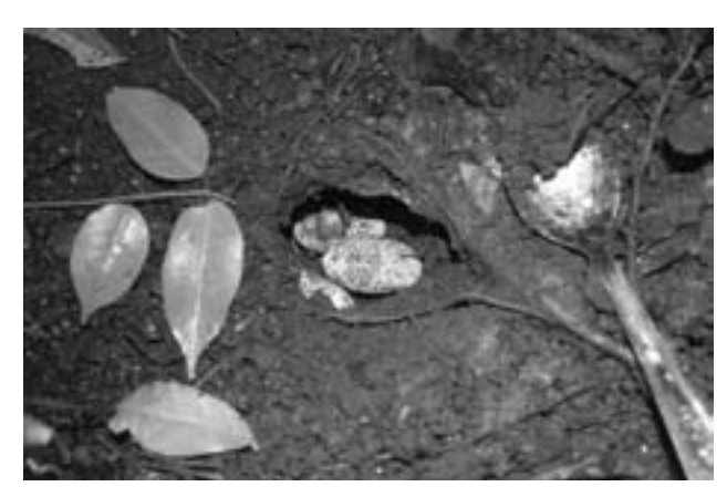
The first Crested Iguana nest located; excavated to show the three large eggs.

The next day, as the rain continued and we began to reminisce fondly of the dry season, we returned to that same site.