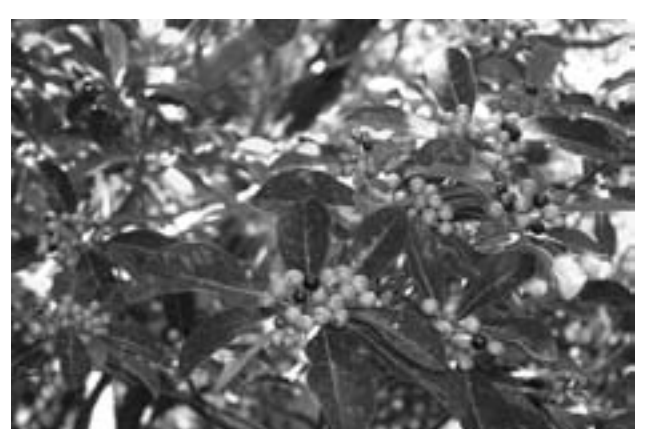
The fruiting Cevua tree ( Vavaea amicorum ) is important in the wet season diet of Crested Iguanas on Yadua Taba Island. Only the soft and ripe purple fruit will be selected and eaten during this season of plenty.

located a single gravid or nesting female. However, we had seen hatchlings appear toward the end of November in several years — but when and where the eggs are laid remained a mystery. Do female Crested Iguanas migrate to communal nesting areas, and do they guard their nest sites like many iguanas? These are just some of the questions that Suzi wants to answer during her Ph.D. project on the species. Because eggs laid in captivity take