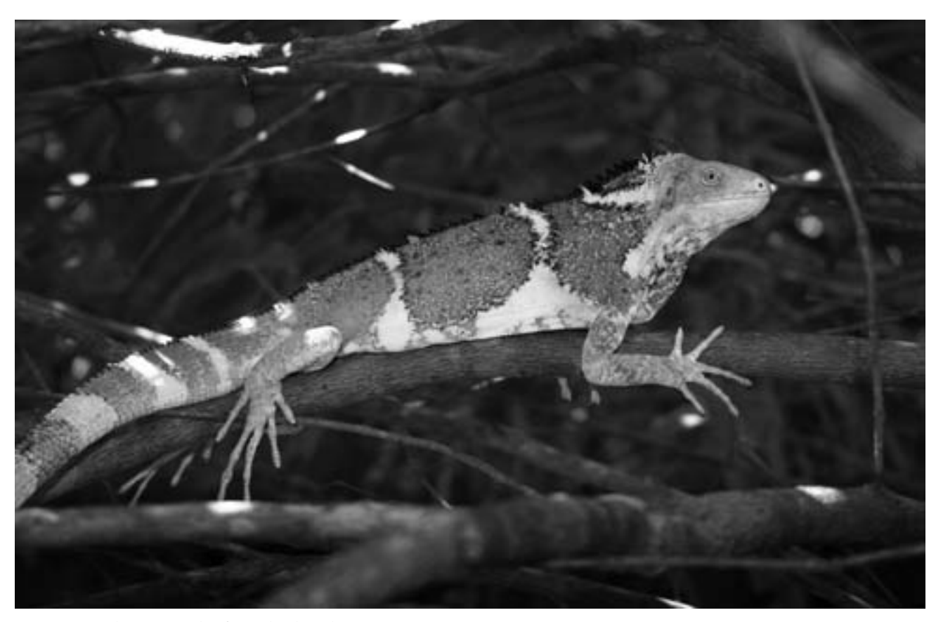
A Fijian Crested Iguana watches from a low branch.

The forest on Yadua Taba is classified as "tropical dry forest." The canopy is low, usually 6–10 m. The island receives less than 200 cm of rain per year, nearly all during the 3–4 month