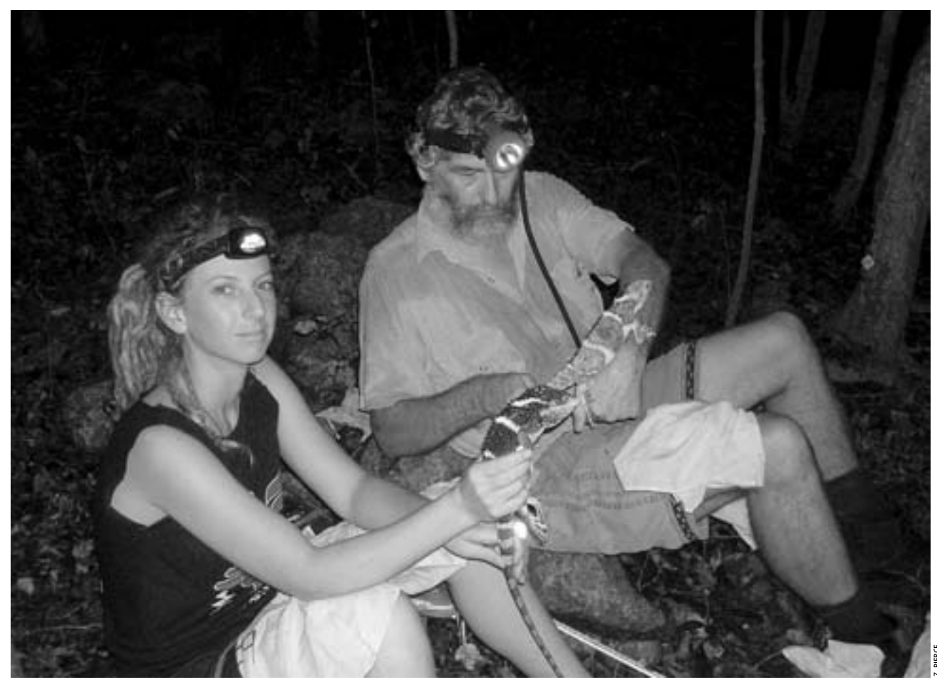
The authors processing captured Crested Iguanas in the forest on a dry night.