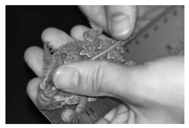
Measuring the total body length of a Texas Horned Lizard.

Bluestem (Schizachyrium scoparium), Big Bluestem (Andropogon gerardii), Indiangrass (Sorghastrum nutans), and Maximilian Sunflower (Helianthus maximiliani). Other native species include Side Oats Grama (Bouteloua curtipendula), Eastern Red Cedar (Juniperus virginiana), and American Elm (Ulmus americana). Prominent non-native species include Oldworld Bluestem