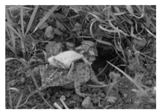
Texas Horned Lizard with an old-style transmitter and pack at nest