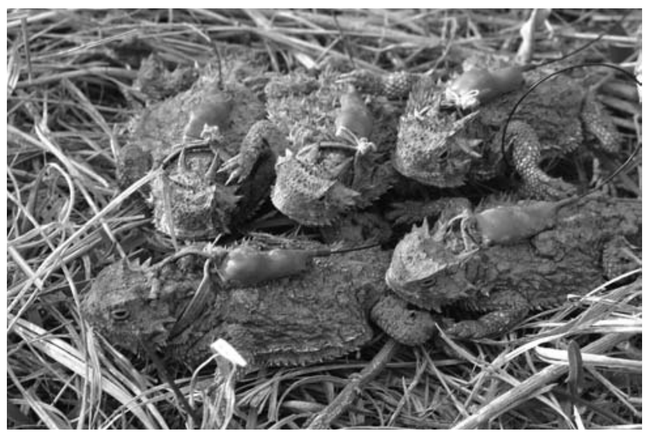
Five Texas Horned Lizards sluggish after removal from hibernacula on a cool spring morning.