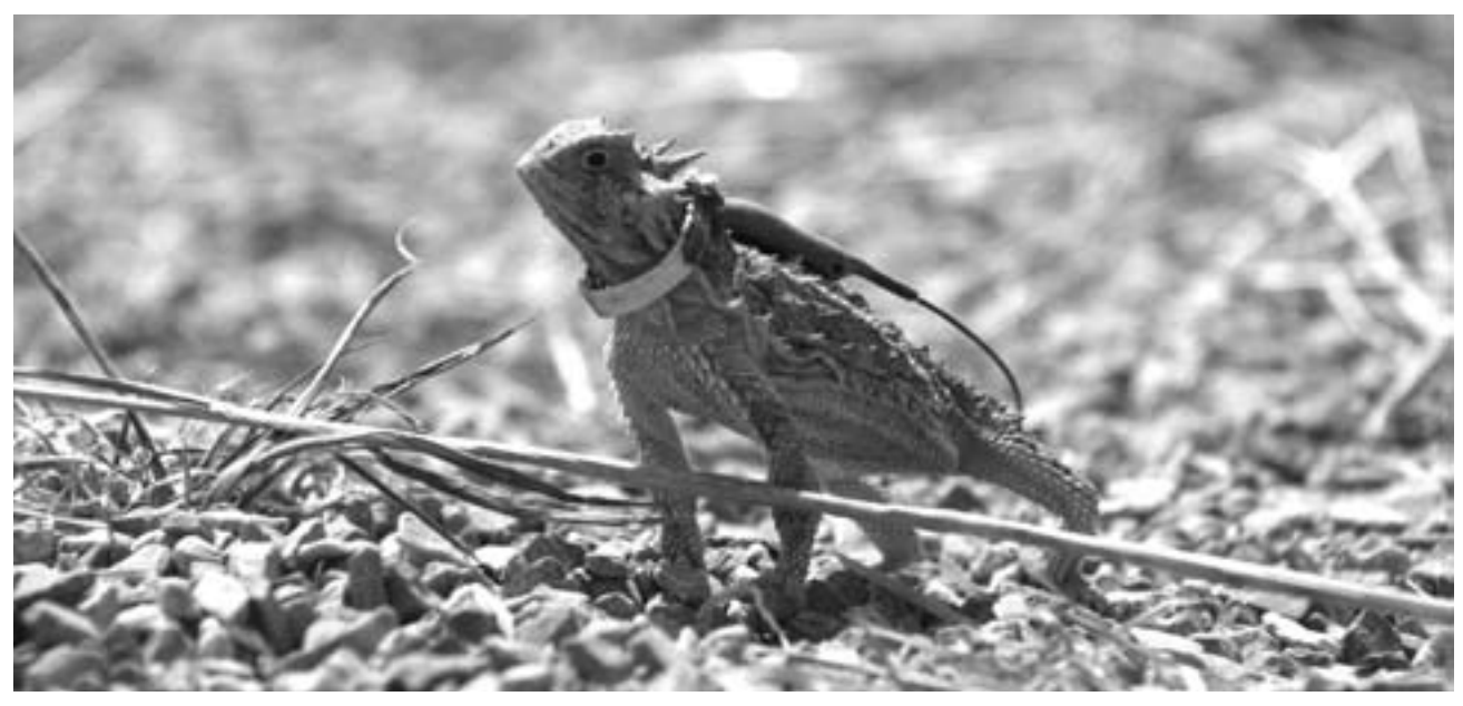
Texas Horned Lizard cooling itself on gravel nature trail.