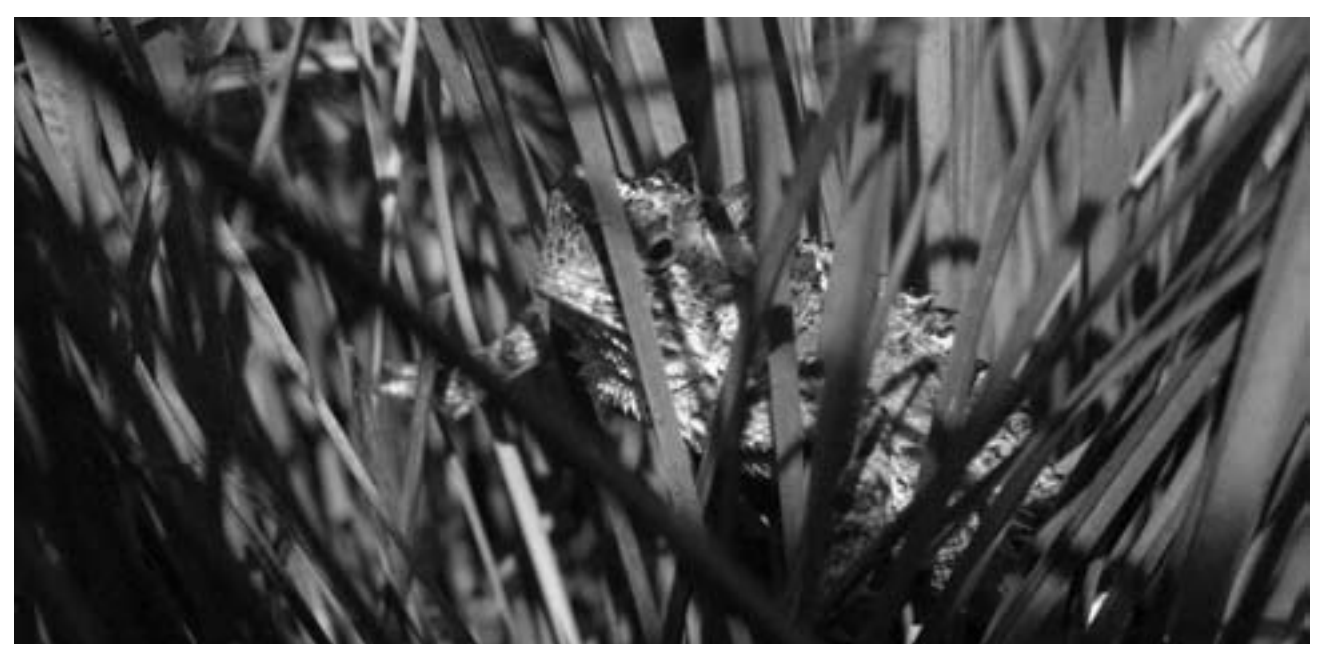
Texas Horned Lizard peering through native Bluestem.