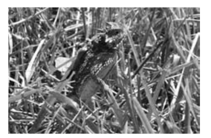
Texas Horned Lizard peering over Oldworld Bluestem.