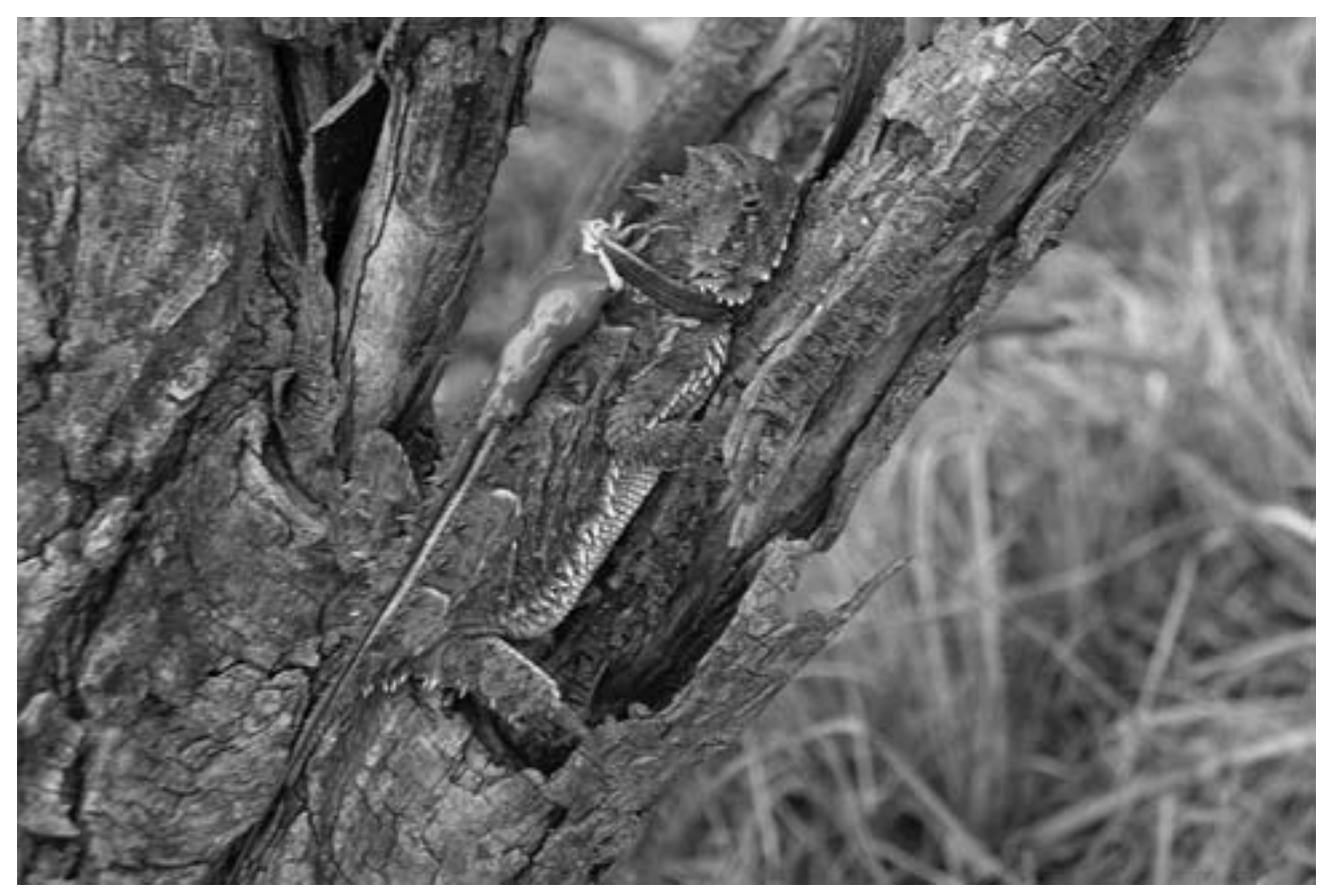
Texas Horned Lizard resting in small tree.