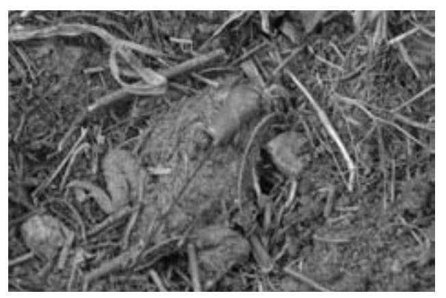
Texas Horned Lizard just prior to emergence from hibernation.