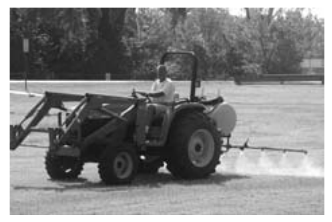
Spraying herbicide on turf to restore the area to native grass.

Capture locations and other documented historical sighting locations were used to construct a distribution layer for lizards. This was accomplished with the buffer tool in ArcMap, creating 360-m (maximum home range length) buffers around