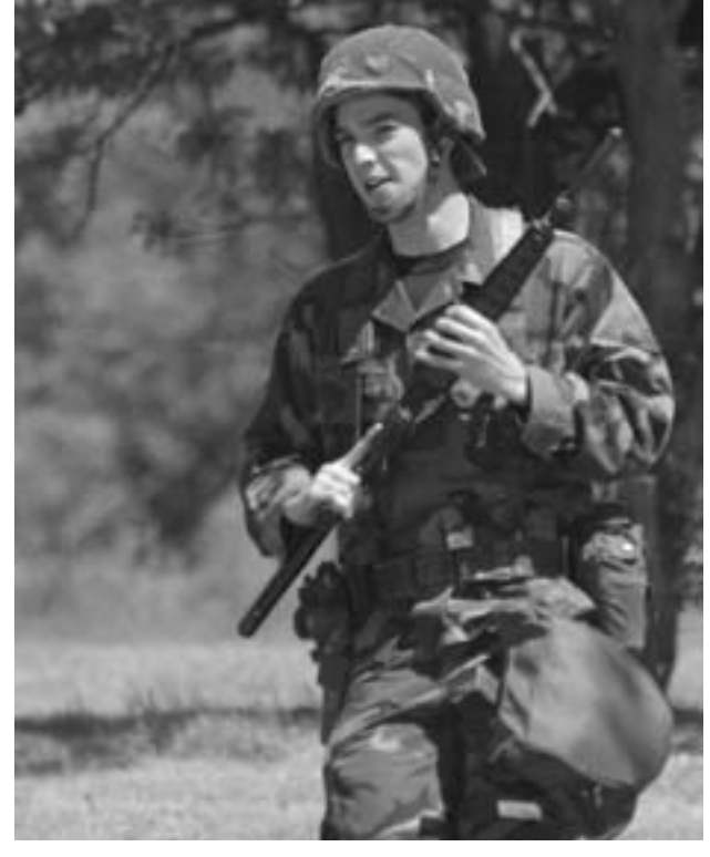
Military training on a busy Air Base. Both the lizard and the military require access to the base's resources.