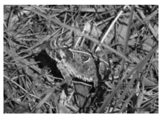
The white middorsal line of the Texas Horned Lizard is cryptic, providing excellent camouflage in a native grass environment where the stripe mimics dead plant stems.

environments. We hope that this knowledge will foster informed management and decision-making regarding the species across its range. Such management in return would promote more robust and stable populations. This would lessen the potential for federal or state listing as threatened or endangered species, thereby precluding potential land use and other restrictions on the military and private landowners. In this scenario, both humans and nature win.