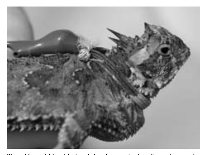
Texas Horned Lizard in hand showing an elastic collar and transmitter mounted on its back.