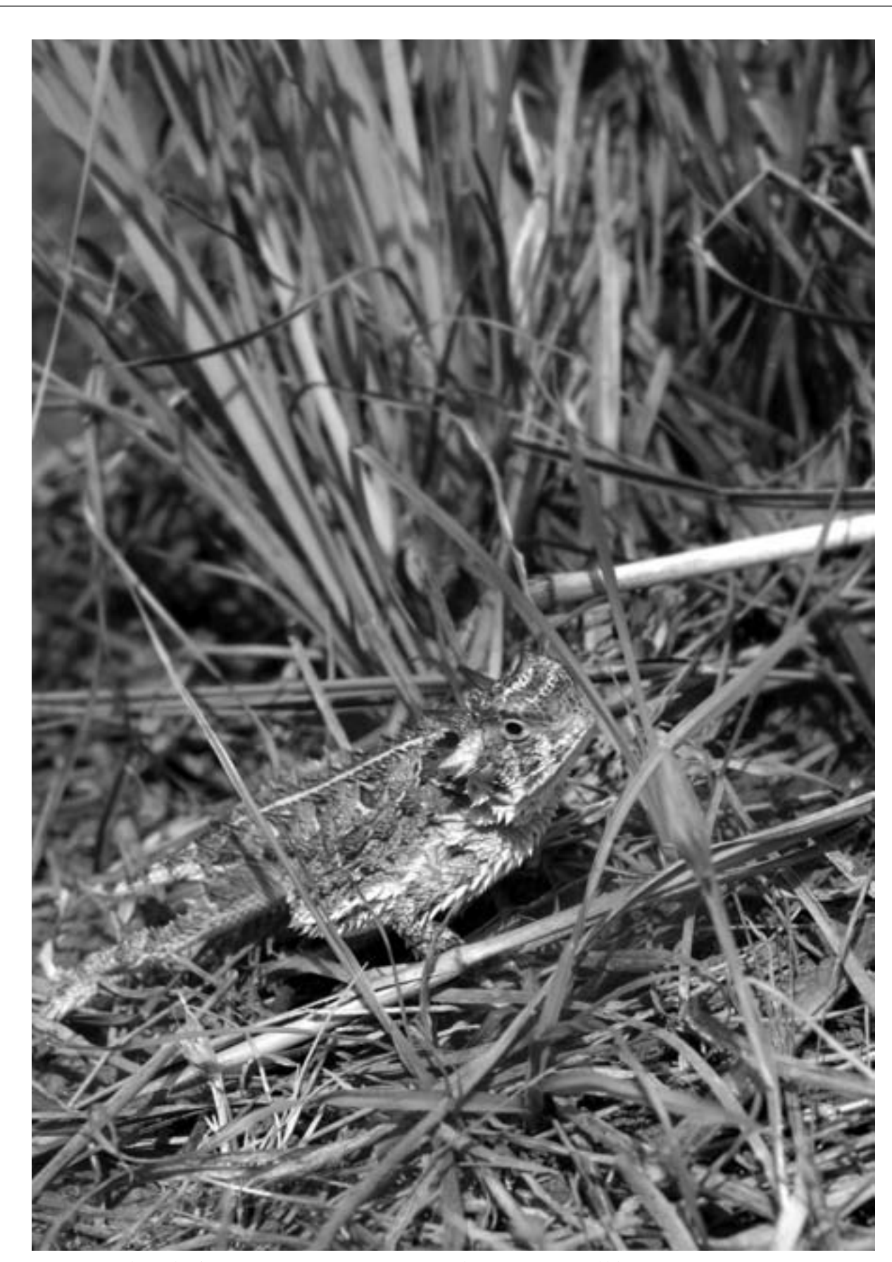
A Texas Horned Lizard ( Phrynosoma cornutum ) in native grass at Tinker Air Force Base, Oklahoma.