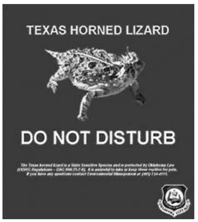
Educational signs alert humans to lizards on the base.

United States Fish and Wildlife Service (USFWS). 2001. National Survey of Fishing, Hunting, and Wildlife Associated Recreation – National Overview. USFWS Report, May 2001. Department of the Interior, Washington,