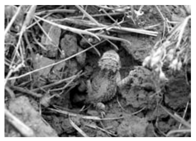
Hatchling Texas Horned Lizards emerging from nest site.

Stark (2000) and Burrows et al. (2001) found lizards to utilize a mosaic of vegetation types from bare ground to areas densely vegetated with forbs and grasses. Fair and Henke (1998) and Burrows et al. (2001) indicated that Texas Horned Lizards require a mixture of open and vegetated habitats to meet thermoregulatory requirements. This was apparent in our study, with lizards using grasses, forbs, shrubs/small trees, and bare ground. When lizard locations where compared with GIS vegetation layers, no preference was shown regarding vegetation type, other than an apparent avoidance of Red Cedar shrubland. In addition, some areas that were known to be more densely vegetated and isolated from bare ground and trails were lacking in lizard locations. GIS layers also showed home ranges to be closely associated with graveled nature trails and paved walking/jogging trails (Endriss 2006). Vegetation structure and availability of bare ground seems to be more important to lizards than the vegetation species type (i.e., whether native or not). Therefore, gravel and paved trails within the study site are likely very important for thermoregulation and movement between habitat resources.