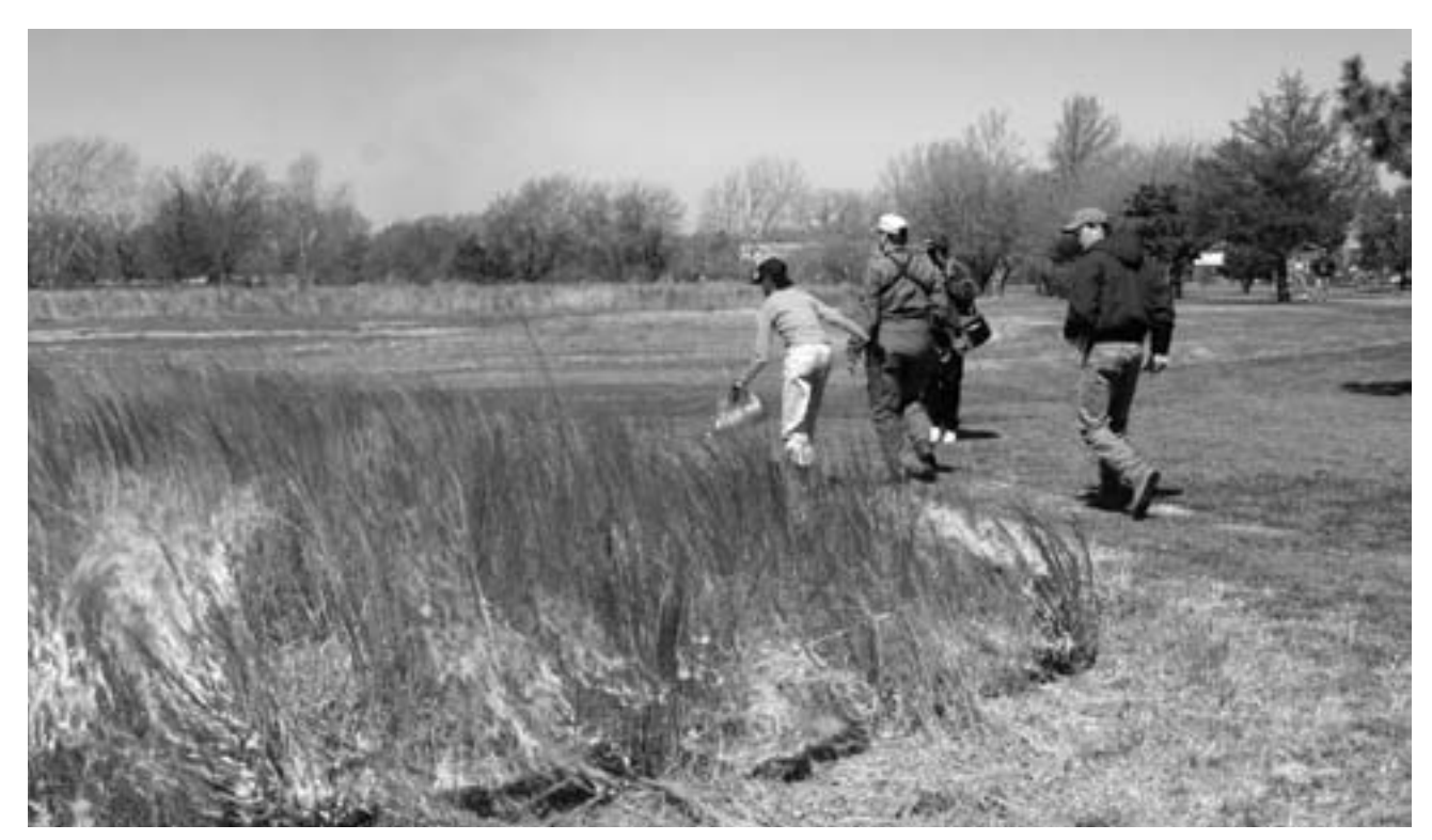
Land managers often use prescribed burning for prairie management. Timing of these events is very important for Texas Horned Lizard management.

Lizard home ranges were determined with the aid of the GIS layer. They averaged 0.84 ha for adult females and 0.90 ha for adult males (95% fixed kernel method, Arc View 3.3 extension). Sixteen lizards were tracked to hibernation sites, where characteristics such as hibernation period (5.5-7.0 months), slope aspects (facing south-southwest), and soil depths (2–12 mm) were recorded. Ten lizards were tracked to nesting locations, where nest depths of 5.0-7.5 cm were found (Endriss 2006). Characteristics such as these are important factors to consider for planning land management activities such as prairie restoration efforts (e.g., spraying, mowing, tilling, disking, and prescribed burning).