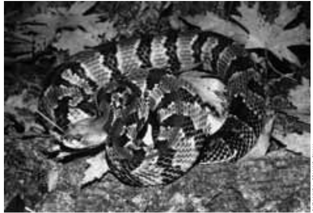
SUZANNE L. COLLINS, CMNH

The interlocking segments of the rattle generate a "buzz" when shaken rapidly, such as by this Timber Rattlesnake ( Crotalus horridus ). Although superficially similar to the call of a cicada, the likelihood that rattlesnakes mimic an insect to attract avian prey is very slim, and belied by the fact that rattlesnakes feed almost exclusively on mammals.