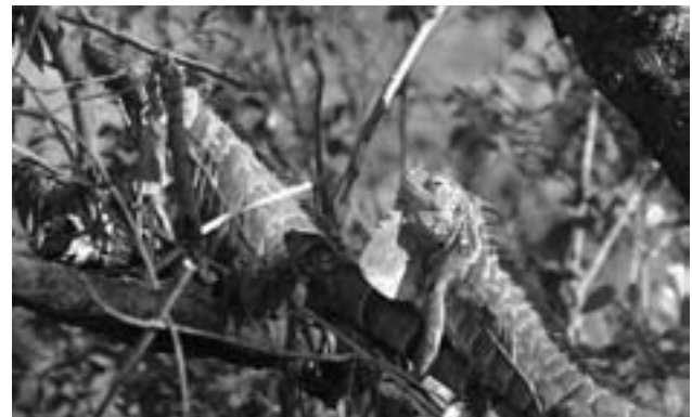
Two Green Iguanas ( Iguana iguana ) on a Strangler Fig ( Ficus aurea ) on Key Largo, Monroe County, Florida (photographic voucher UF 149986). These iguanas were observed feeding on adjacent Spanish Stopper ( Eugenia foetida ).