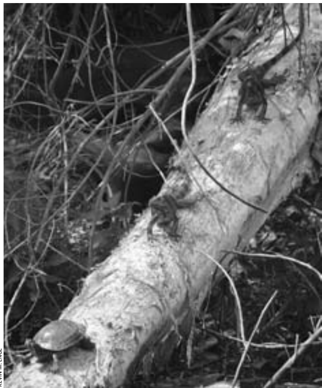
Juvenile Green Iguana ( Iguana iguana ) on a non-native Silk Floss ( Chorisia speciosa ) tree in Lake Worth, Palm Beach County, Florida (photographic voucher UF 149868).