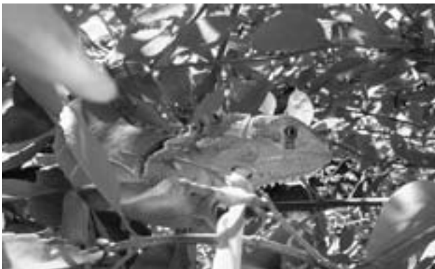
A juvenile Green Iguana ( Iguana iguana ) on a non-native Golden Dewdrop ( Duranta erecta ) in Naples, Collier County, Florida (photographic voucher UF 146274). This iguana appeared to be foraging on fruit from an adjacent Firebush ( Hamelia patens ).