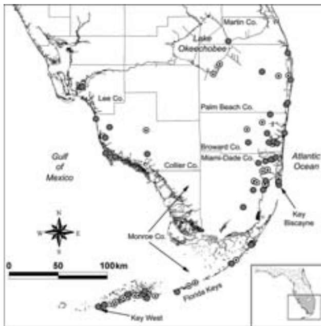
Records (N = 3,169) of Green Iguanas ( Iguana iguana ) in southern Florida. Open circles indicate preserved specimens and photographic vouchers (N = 1,088) collected between 1965 and 2006, circles with central dots indicate observations (N = 2,081). A circle may represent more than one record.

Neonate and juvenile Iguana iguana feed on vegetation (i.e., new shoots, leaves, blossoms, and fruits) and insects such as grasshoppers (Hirth 1963). In addition to these items, adults have been reported to feed on bird eggs (Lazell 1973) and carrion (Loftin and Tyson 1965). In Florida, neonates and juveniles feed on vegetation, insects, and tree snails (Townsend et al. 2005), whereas adults are primarily herbivorous, but may take additional items as well. A juvenile I. iguana appeared to be feeding on Firebush ( Hamelia patens ) fruits in a Naples garden (J. Schmid, pers. comm.). Fecal contents of a Homestead, Florida individual included flowers, leaves, and fruits from non-native Jasmine ( Jasminum sp.) and Washington Fan Palms ( Washingtonia robusta ; Meshaka et al. 2004b). At Bill Baggs Cape Florida State Park (BBCF) on the southern tip of Key Biscayne, we have observed I. iguana feeding on Nicker Bean ( Caesalpinia bonduc ),