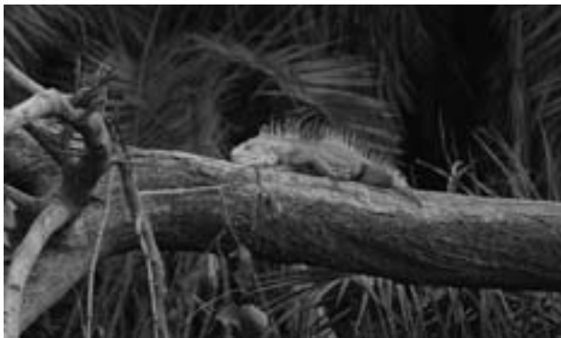
KEVIN M. ENGE

Adult male Green Iguana ( Iguana iguana ) basking on a fallen tree during a cool day at Crandon Park on Key Biscayne, Miami-Dade County, Florida (photographic voucher UF 150121). Non-native Senegal Date Palms ( Phoenix reclinata ) can be seen in the background.