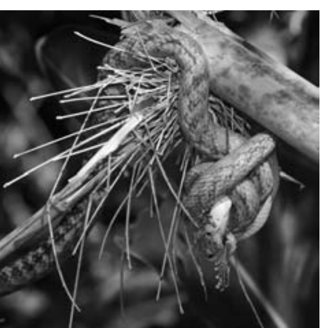
Although we did not realize it at the time, this Forest Night Snake ( Ithycyphus perineti ) was on the hunt. Note the frog hiding in the bamboo in the lower right corner of the upper frame. The snake completely ignored us during the hunt and throughout his meal.