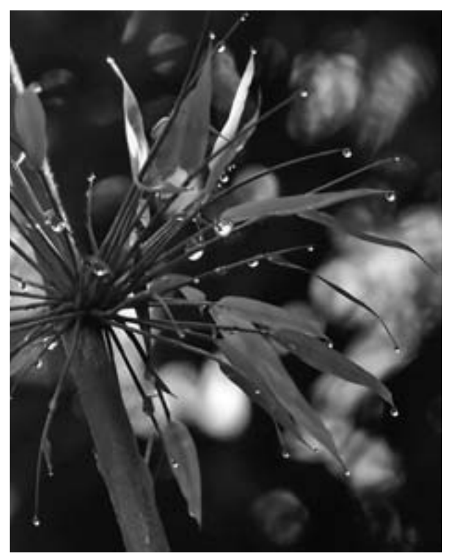
The morning dew forms on a bamboo plant showing how geckos, chameleons, and other creatures get the water on which they depend.

Lygodactylus and tree frogs of the genus Mantidactylus. A Phelsuma fantasy come true!