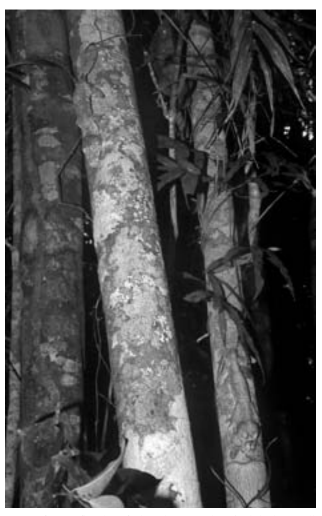
A pair of camouflaged Leaftail Geckos ( Uroplatus henkeli ) sleep, well hidden in the primary forests of Madagascar.

Hunting Phelsuma in dense bamboo thickets is an adventure in itself. The floors of the thickets are covered a foot deep in leaf litter and broken bamboo stalks. Each step could startle any creature away or, worse yet, the stalker could be impaled on