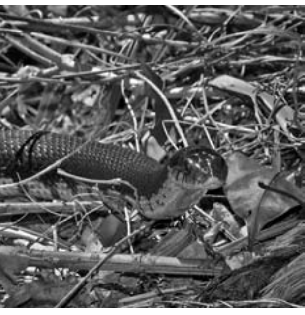
The floor of the bamboo jungle presents a number of challenges and surprises including this Madagascan Hognose Snake ( Leioheterodon madagascariensis ).

ored P. klemmeri , which we were able to confirm lives mostly in and on the dead brownish-yellow bamboo. At the time of the first sighting, several expedition members were trying to capture a Madagascan Hognose Snake ( Leioheterodon madagascariensis ), for which they had set aside a magnificently colored caterpillar. With the discovery of the Phelsuma , however, the snake was stashed in a backpack for later study, the caterpillar quickly for-