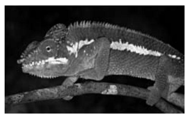
We found several rare "Pink Panther Chameleons" (Furcifer pardalis) during this trip.

hide but, if you wait quietly for a few minutes, they often return to their previous basking spots and into clear view.