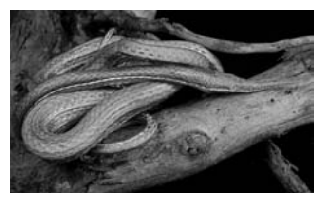
This Madagascan Leaf-nosed Snake ( Langaha nasuta ) was one of the most interesting snakes found on the Expedition.

one of the many spear-sharp bamboo stalks standing upright at knee to waist height, resulting in an injury that could prove lethal in such a remote part of the world. So, you move slowly, quietly, and as carefully as you can. Teams of two are best to quickly trace each stalk and branch up and down and side to side, alert for slight movements, flashes of color, or anything that appears abnormal. Most geckos will see you first and quickly