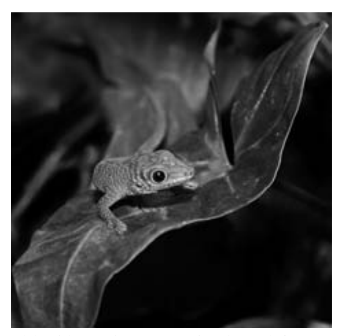
A baby Phelsuma madagascariensis grandis perches on a leaf to survey its surroundings.

meters, we also found a hatchling P. dubia shedding, possibly for the first time. The vibrant blue dots only seen in juveniles were readily apparent beneath the shedding skin. We had only just arrived, and were already surrounded by exotic geckos!