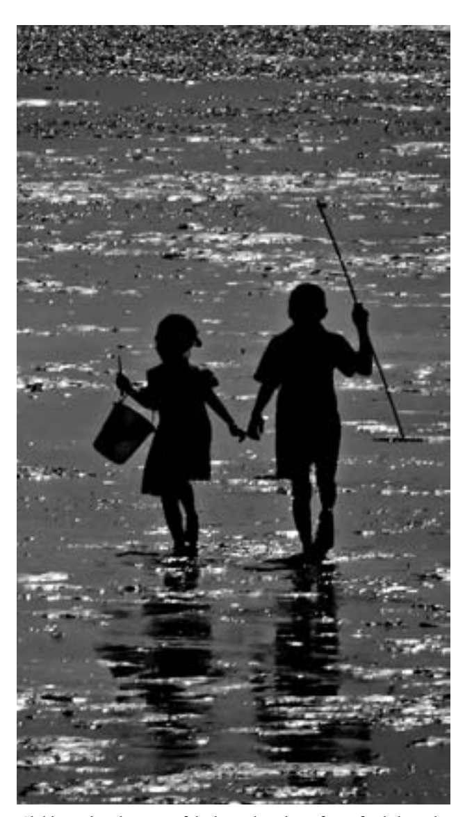
Children take advantage of the low tide to hunt for seafood along the southern coast of Nosy Be.

Phelsuma , or Day Geckos, as the common name implies, are among the few gecko genera that are almost completely diurnal. Because they also can be fantastically colored in vibrant