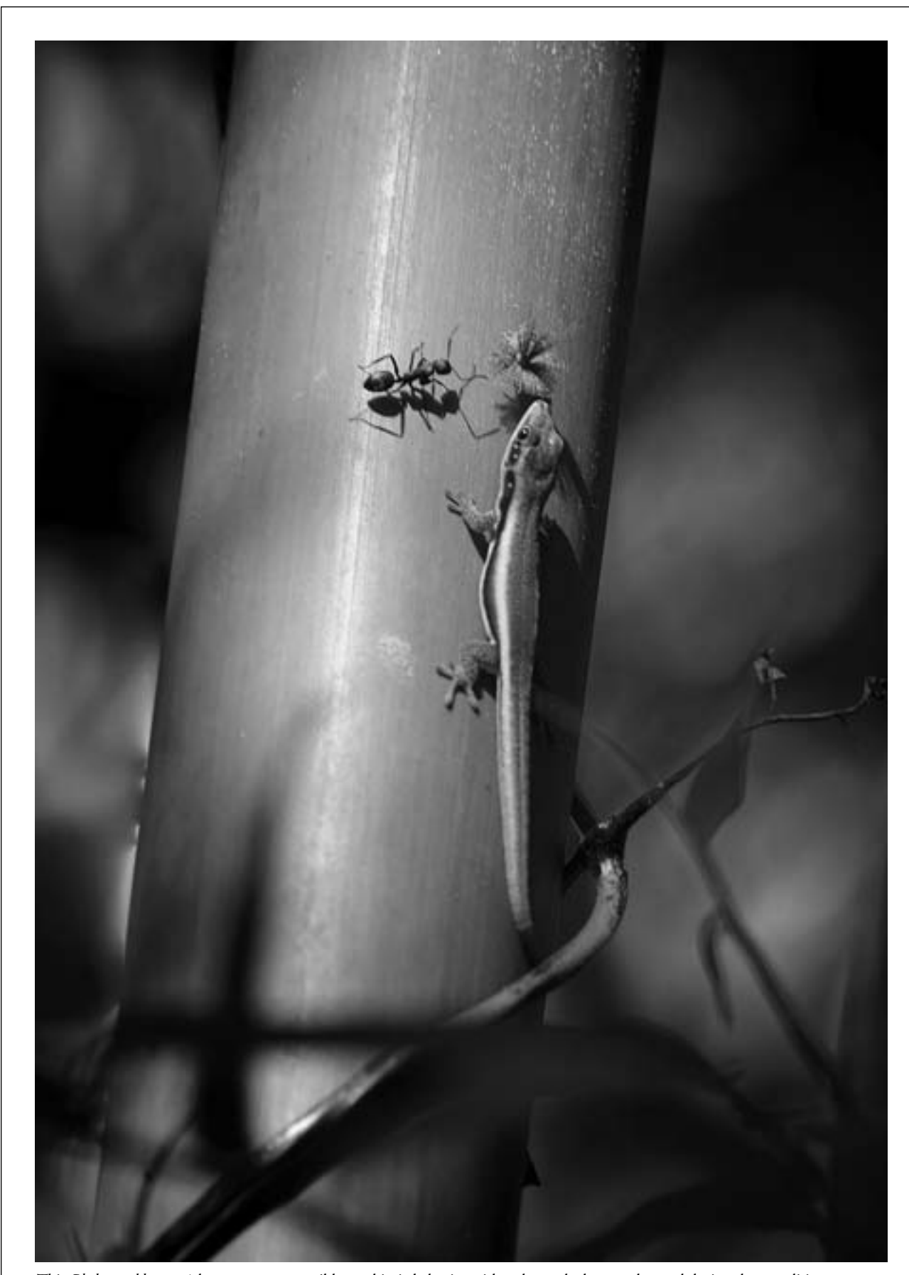
This Phelsuma klemmeri demonstrates a possibly symbiotic behavior with arthropods that we observed during the expedition.