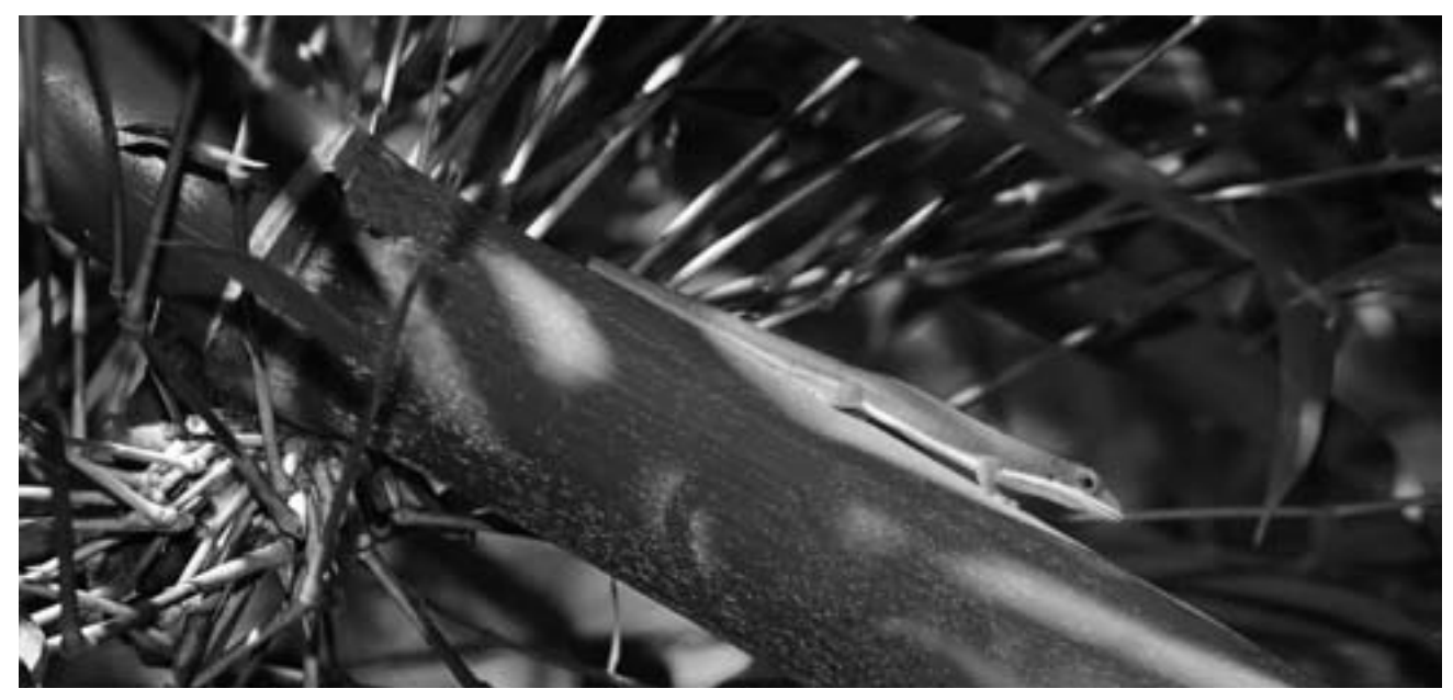
The recently discovered Phelsuma vanheygeni lives on green bamboo stalks. When threatened it retreats into thickets of branches to hide.