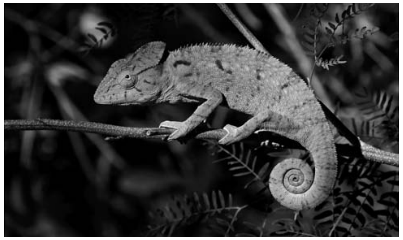
What this Oustalet's Chameleon (Furcifer oustaleti) lacks in size, it makes up in beauty.