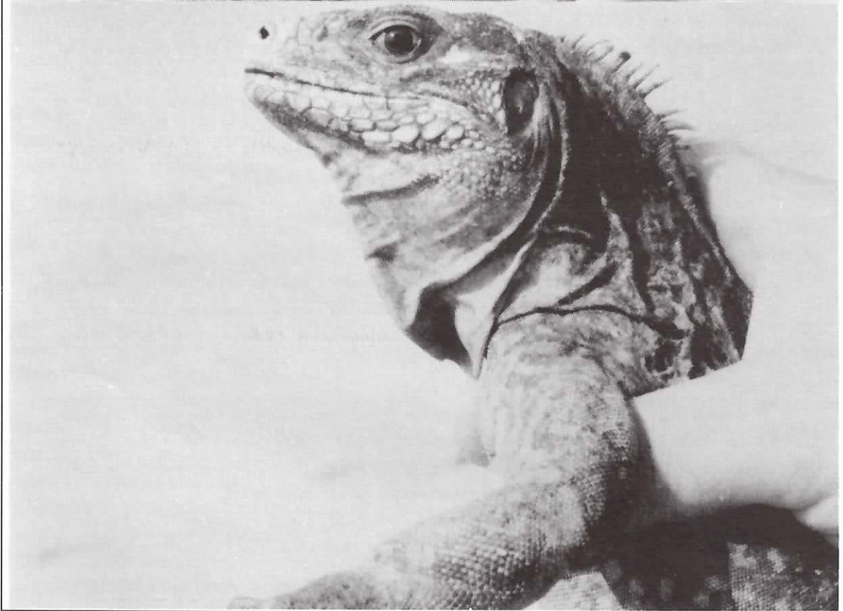
Males, Cyclura rileyi nuchalis .