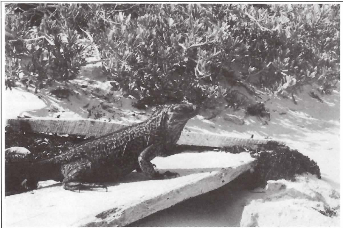
Female, Cyclura rileyii nuchalis , in habitat.