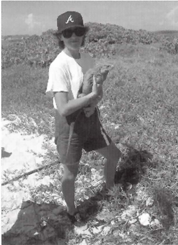
Figure 5. The iguanas on Low Cay appear to be mostly old adults. Although regarded as the smallest Cyclura species, C. r. rileyi on Low Cay attain a maximum body size equivalent to or larger than several other taxa.

disappeared. Because local extinction events can occur (e.g., by natural course of disease), we need not assume that empty cays are incompatible with iguanas. If these cays can be deemed or rendered satisfactory, iguanas from healthy populations or from a head-start/release program (e.g., Alberts, 1995) could be reintroduced.