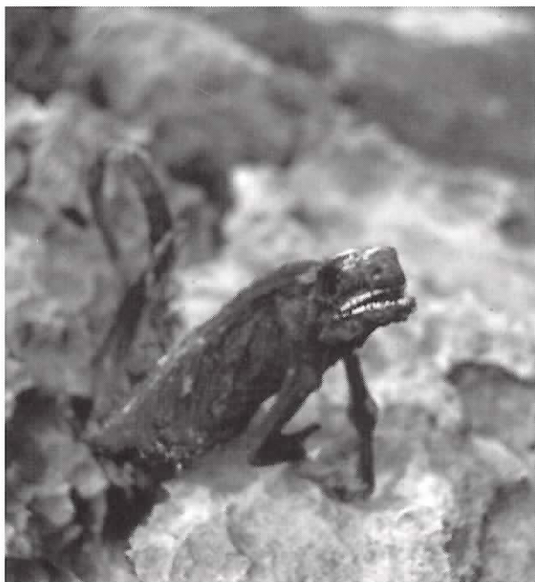
Figure 4. Mummified iguana from Green Cay. Decaying iguana carcasses found on Guana Cay in 1994 were indicative of a die-off of unknown cause.

condition may reflect natural foods that they had eaten (e.g., fruits or insect larvae; T. A. Wiewandt and J. B. Iverson, pers. comm.). On Guana Cay, we sighted 15 iguanas in May 1993, while in May 1994 we sighted only eight or nine (including two juveniles). Six adult carcasses (including an individual marked in 1993), all in a similar state of decay, were discovered on Guana Cay in March 1994, and two others in a much greater state of decay were found in May 1994 (Jones et al., 1995; see Figure 4). Lastly, on Low Cay, three adult rats (of unknown species but non-native to San Salvador; Olson et al., 1990) were seen during midday on 20 July 1994, all within or at the periphery of dense Coccoloba patches. Local residents described an abundance of rats on the mainland.