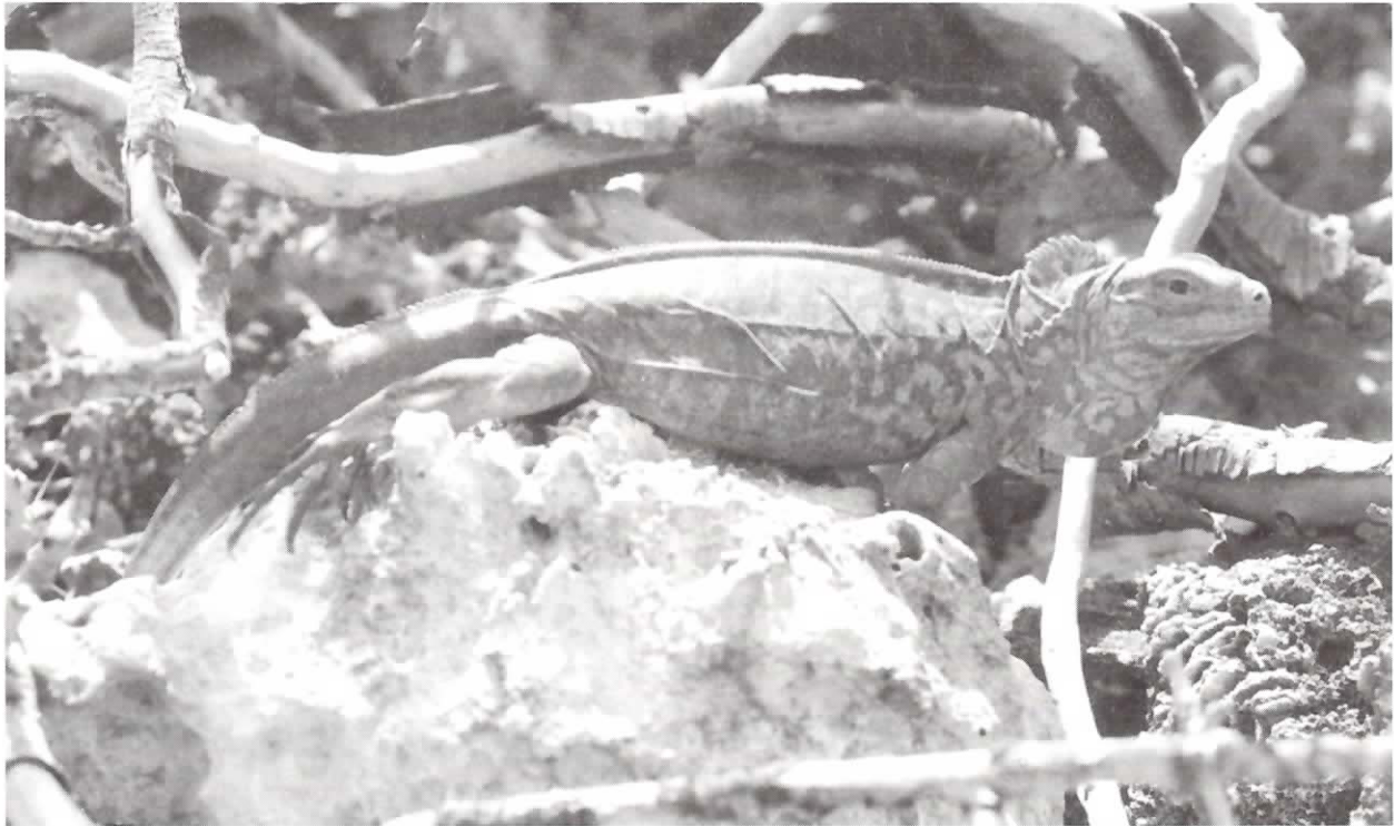
Figure 1. San Salvador rock iguana, Cyclura rileyi rileyi , on Green Cay.

1974, Gicca (1980) considered these populations to be near maximum densities and estimated a combined maximum of 93 animals. Assuming that iguana density on High Cay (where he saw only seven animals during his brief visit) was similar to other cays, he suggested another 113 iguanas were possible on High Cay and surmised that fewer than 500 animals remained on the mainland. Ostrander (1982) reported the discovery of a new population on Guana Cay in Hermitage Lake (Northeast Arm of Great Lake), where he saw or heard a minimum of 45 individuals and “conservatively” estimated the population to be at least 80. More recently, Blair (1991) visited several cays in 1990 and summarized their relative abundance on six cays, their very rare but continued presence on the mainland, and their presumed extirpation on at least seven cays. Blair believed that roughly 500 individuals remained. Although these reports reflected well the precarious nature of the iguana’s status, none were based on rigorous sampling.