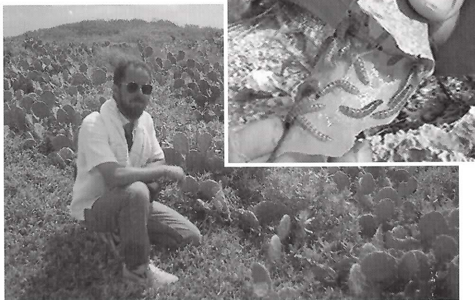
Figure 3. The extensive prickly-pear cacti ( Opuntia stricta ) on Green Cay (left) are being decimated by the larvae (inset; a video image) of an introduced moth from South America ( Cactoblastis cactorum ).

On Manhead Cay, twenty animals were seen well enough to determine whether they were marked; of these, six were previously marked. The Lincoln-Peterson index suggested a total of 53 for well-seen iguanas. Six (37.5%) of the 16 marked animals were resighted. An additional eight iguanas were poorly seen, and these “uncertain” sightings were estimated to account for another 21 animals. By summing these two estimates, we calculated a total of 74 iguanas on Manhead Cay, with an absolute minimum (actual number of iguanas counted) of 28 (see Table 1).