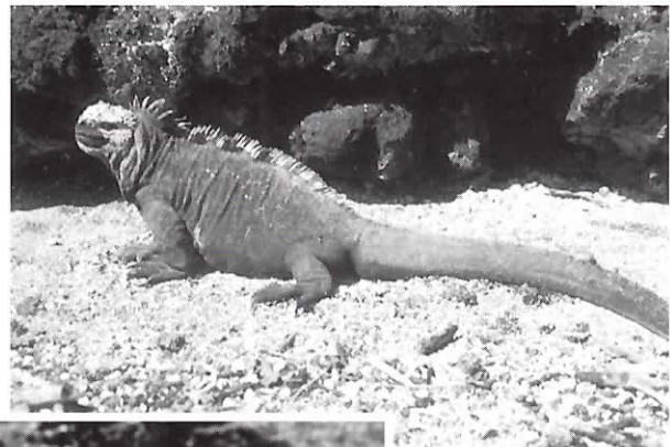
ABOVE: The Galápagos marine iguana ( Amblyrhynchus cristatus ).

Did the mitochondrial or the nuclear data convey a wrong picture? The answer may be much simpler. Unlike mitochondrial DNA, nuclear DNA is inherited from both the mother and the father. In other words, males that reproduce in a foreign population transmit their nuclear genes to their offspring, but not their mitochondrial genes. For the marine iguanas this means that males probably migrate relatively frequently among different island populations, and thus spread nuclear alleles throughout large parts of the archipelago, whereas females migrate little, leading to the observed geographically restricted distribution of the mitochondrial haplotypes. A similar analysis of nuclear markers in the land iguanas is currently being conducted in collaboration with Melanie