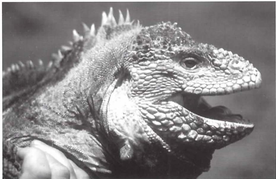
The Galápagos land iguana ( Conolophus subcristatus ). "These lizards, like their brothers the sea-kind, are ugly animals; and from their low facial angle have a singularly stupid appearance" (Charles Darwin).

Mitochondrial DNA (mtDNA) sequence data (c. 1 kb of the 16S and the 12S genes) were employed to re-evaluate the phylogenetic relationships among the nine genera of Iguanidae (sensu Frost and Etheridge, 1989), namely the Galápagos marine and land iguanas ( Amblyrhynchus and Conolophus ), the black or spiny-tailed iguana ( Ctenosaura ), Enyaliosaurus (often included in Ctenosaura ), the green iguana (Iguana), the West Indian rock iguana ( Cyclura ), the chuckwalla ( Sauromalus ), the Fiji or banded iguana ( Brachylophus ), the desert iguana ( Dipsosaurus ), and as an outgroup the Malagasy iguana ( Oplurus ). The phylogenetic analyses largely confirmed the findings of the morphological studies. The desert iguana ( Dipsosaurus ) appeared to be the most basal lineage among the nine Iguanidae, followed by the Fiji iguana ( Brachylophus ) as the sister taxon to the seven remaining taxa, the so-called Iguanini. The molecular data suggested further that Enyaliosaurus and Ctenosaura were the closest living relatives of the Galápagos iguanas and that the latter shared a