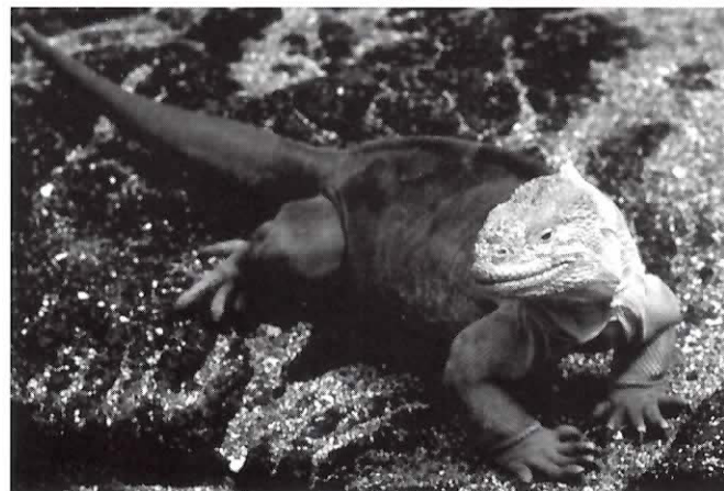
LEFT: The Galápagos land iguana ( Conolophus subcristatus ).