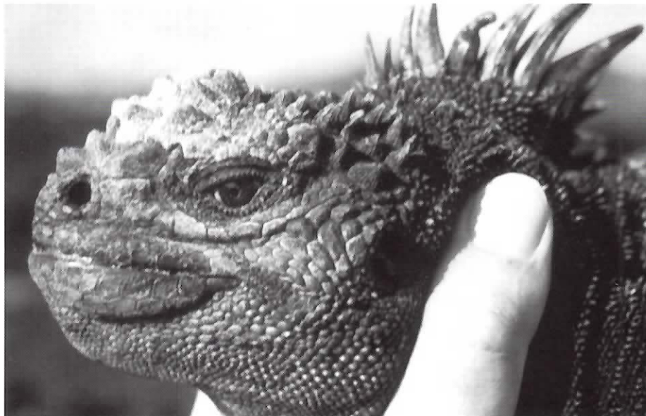
The Galápagos marine iguana ( Amblyrhynchus cristatus ). "It is a hideous-looking creature, of a dirty black color, stupid and sluggish in its movements" (Charles Darwin).

The 13 Darwin finch species, for example, evolved apparently from a single ancestral species that colonized the islands not more than 5 million years (MY) ago (Grant, 1994). The Galápagos iguanas, on the other hand, display a very different pattern of evolution. The two endemic genera seem to have diverged long before the finches, but the Galápagos land iguana comprises only two species ( Conolophus pallidus and C. subcristatus ) and the marine iguana one ( Amblyrhynchus cristatus ). Morphological data suggest that the land and marine iguana are sister taxa, that is, like the Darwin finches they probably share a direct common ancestor (de Queiroz, 1987). Thus, it is possible that this ancestral iguana species colonized the archipelago, where it then diverged into the land and the marine iguana lineages. Yet, the oldest of the present Galápagos islands emerged only 5 MY ago,