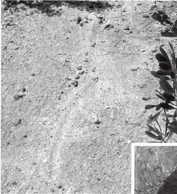
Above: One of many drags found in the sand, most left by the abundant land crabs of Andros, though some were thought to be iguana tail-drags.