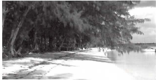
Above: The beach at Forfar Field Station, Andros Island, Bahamas.

That afternoon we investigated the tidal flats of Fresh Creek. The terrain was pretty muddy inland, but by sticking to the shoreline and walking through the shallow water, we were able to