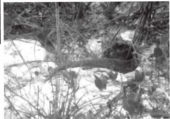
Below: On the last day of the conference, the first live iguana we spotted saw us first and ran for the safety of its burrow.