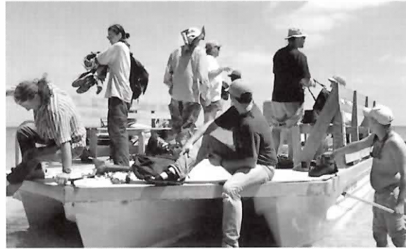
Left: The group aboard one of the boats made available by the Forfar staff, who were as anxious to find iguanas as we were.

cover a lot of area, even wading across to some of the smaller islands. As at other sites, evidence of feral dogs and cats was plentiful, but we also spotted tracks in the sand that looked like tail drags to our iguana-starved eyes.