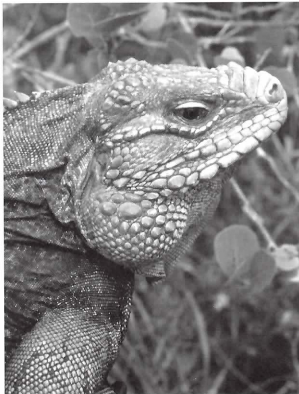
The big one that didn't get away—a large male, Andros iguana.