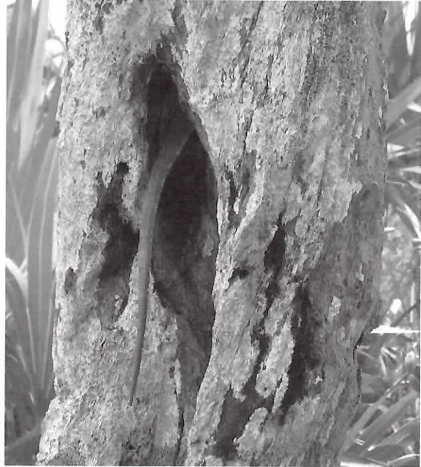
A juvenile C. cyathura is found hiding in the hollow trunk of a dead palm tree.