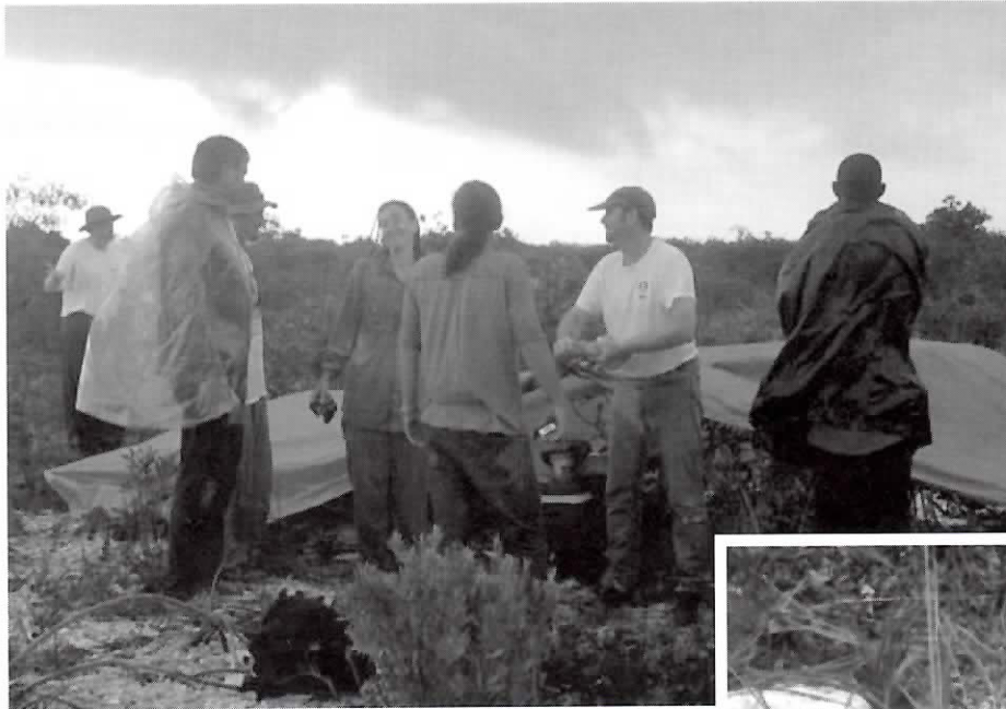
Left: Soaking rains did not deter this group, determined to find iguanas on North Andros.