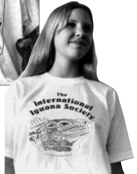
B. Cyclura nubila nubila