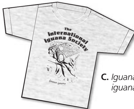
C. Iguana iguana

$13 each, plus $3 for postage & handling ($1 P&H for each additional shirt)