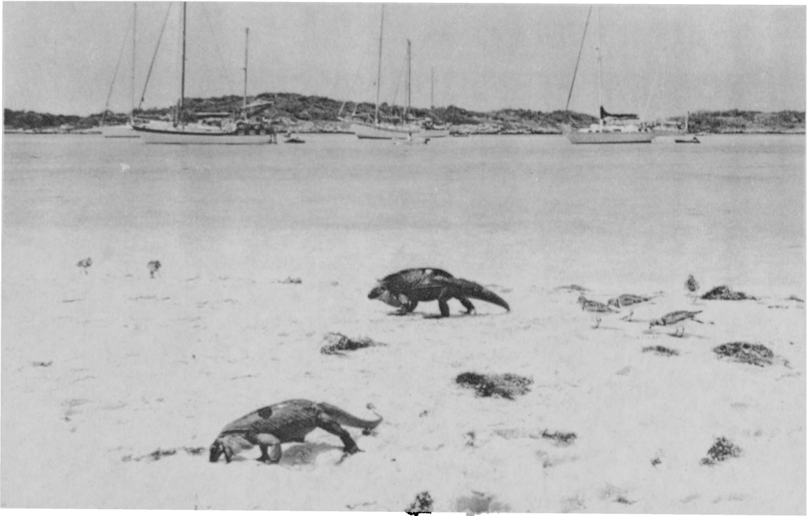
Allan's Cay Iguanas, Cyclura cyclura inornata , patrol Leaf Cay with sandpipers.