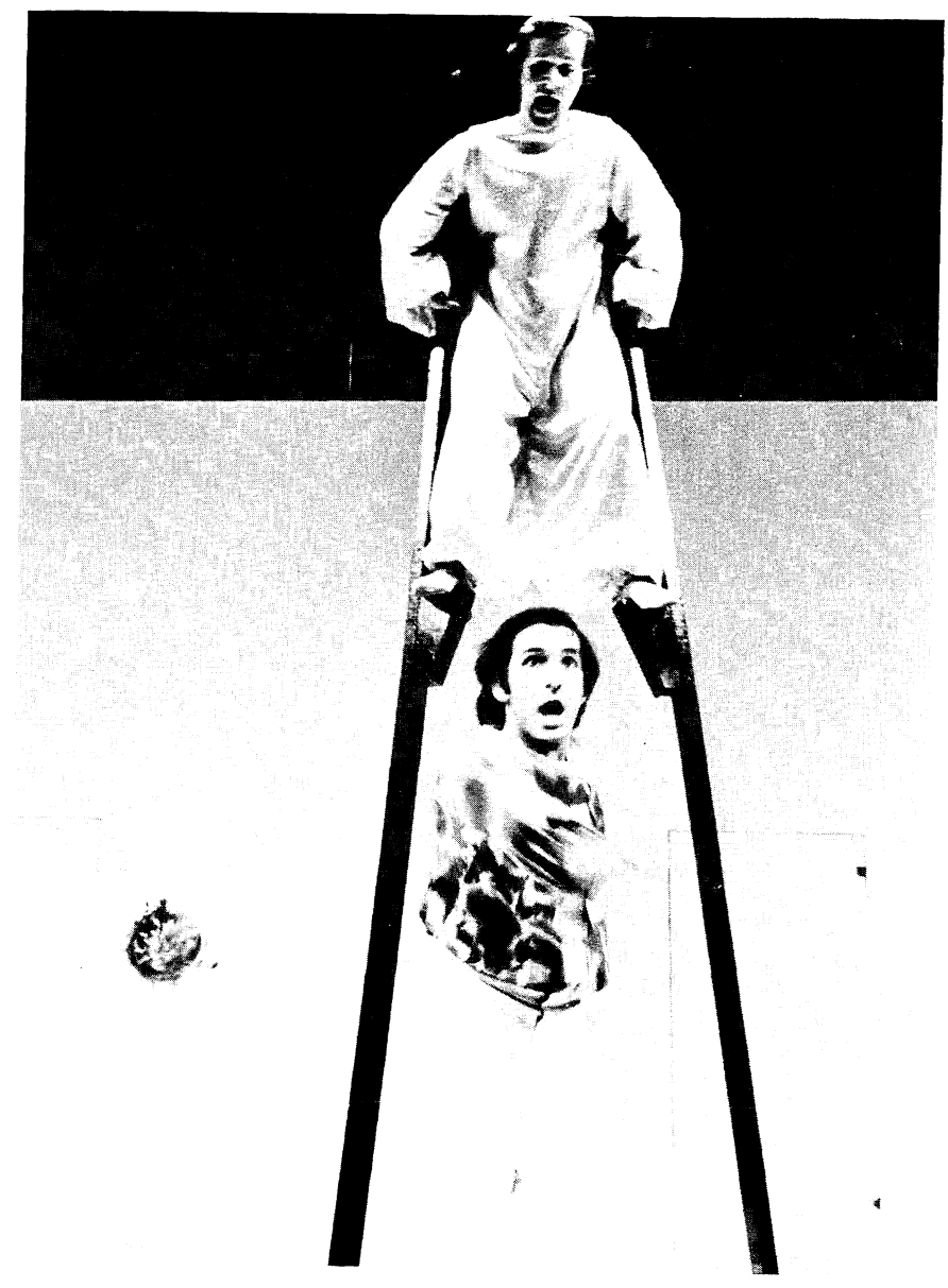
Figure 2. 1970 A Midsummer Night's Dream. Courtesy: The Shakespeare Centre Library: Stratford-upon-Avon.