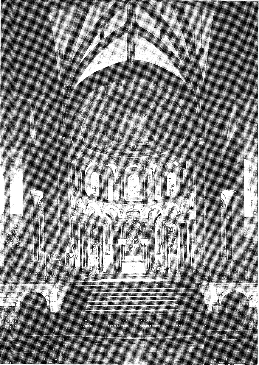
Figure 4. The photos (half-tones), from R.R.B.M. Wagenaar, Maastricht, Papal Basilica and Church of Pilgrimage (Regensburg: Schnell and Steiner, 1995), pp. 1 and 5. Maastricht, Church of Our Lady. P. 1—exterior, tenth-century westwork. P. 5—interior, east choir, twelfth-century.