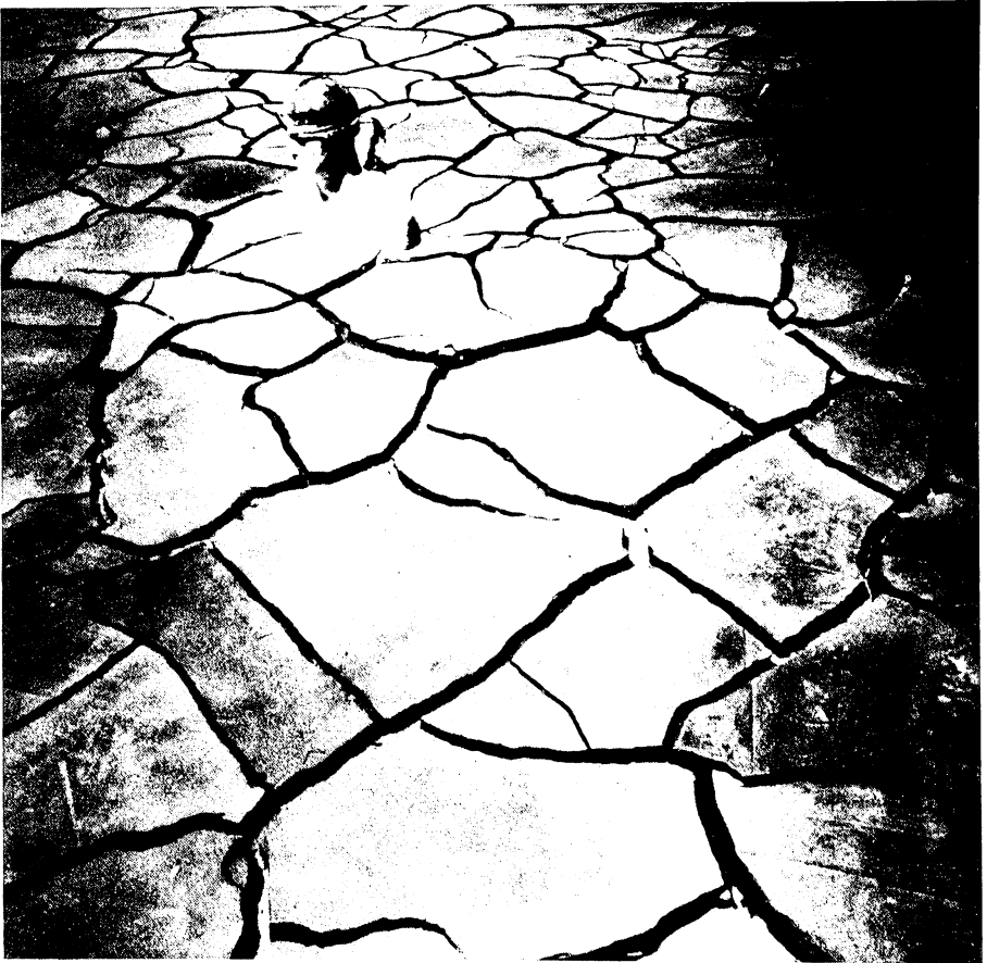
#3. Robert Wilson: Memory/Loss, Biennale Arte, Venice, 1993.