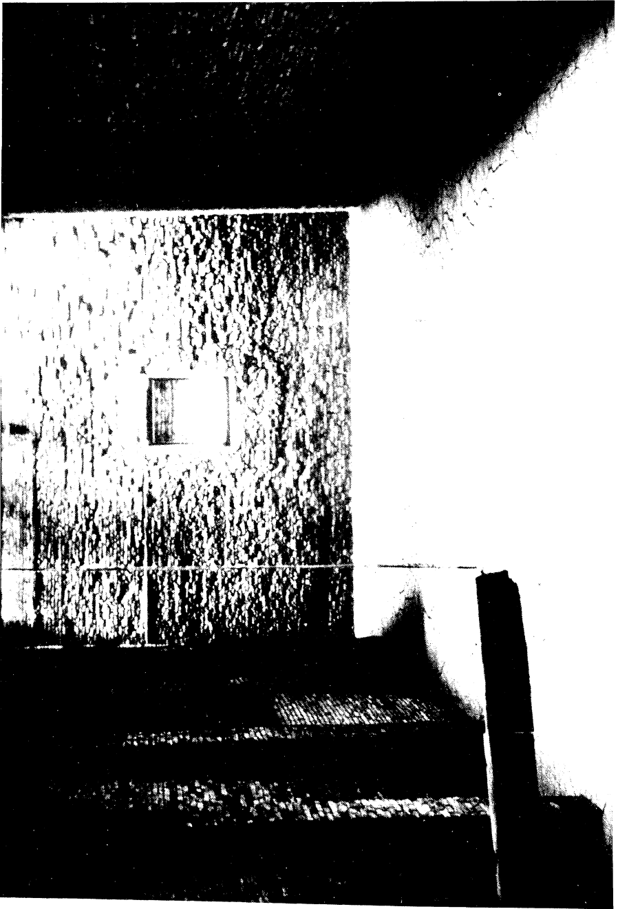
#5. Robert Wilson: Memory/Loss, Biennale Arte, Venice, 1993.