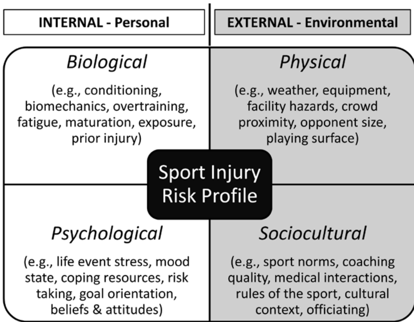
Figure 2 — Sport injury risk profile.

her personal characteristics and status and the profile of risks or protections offered by the physical and sociocultural environment of that situation.