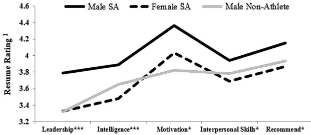
Figure 1 — Test of simple effects results for hypothesis 9 (college athletes without direct internship experience). SA = Student-Athlete. *** p < .001 , * p < .05 . 1 Measured on 5-point Likert-type scale.