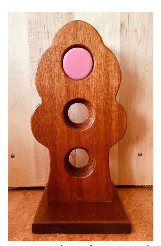
Figure 1. Three-dimensional wooden tree for pitchheight work.

The first work we created was designed to encourage children to explore and demonstrate their understanding of pitch height. We provided a three-dimensional wooden tree with three circular openings (Figure 1). After placing the disks on the device and hearing a pitch on each disk, the child would place the disks in the circular openings to indicate which disk produced the highest pitch, the lowest pitch, and a sound between the highest and lowest pitches.