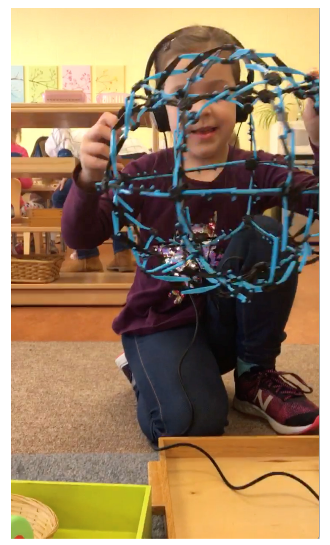
Figure 4. Child manipulating a Hoberman sphere while exploring dynamic changes.

Work 6 encouraged the children to explore dynamic changes. Each disk contained a sound that increased in volume, decreased in volume, or increased and then decreased. The children manipulated a Hoberman sphere, (i.e., an orb that can expand to more than double its size and then retract), to indicate the changes they perceived (Figure 4). This work was exploratory in nature and did not include a control of error.