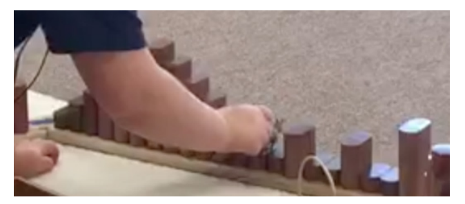
Figure 3. Three-dimensional path indicating melodic direction.

Works 4 and 5 were designed to apply the learning in Works 1–3 to melodic direction. In Work 4, the children heard a piece performed on piano and then moved an object (a small toy kangaroo) across a three-dimensional path to indicate the directions the melody moved (Figure 3). Completing the path before the music ended, or having the music end before the children completed the path, signaled to them that they did not follow the music accurately. In Work 5, the children performed a similar task while listening to three different melodies performed on trombone. The control of error was consistent with the control of error for Work 2.