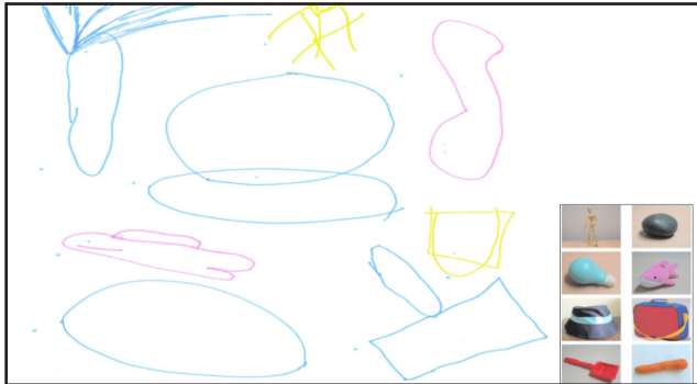
Figure 3. Example of low-scoring convergent-integrative (concrete) task from Evaluation of Potential Creativity assessment.

Scoring for the convergent tasks accounted for a number of elements, including whether the participant