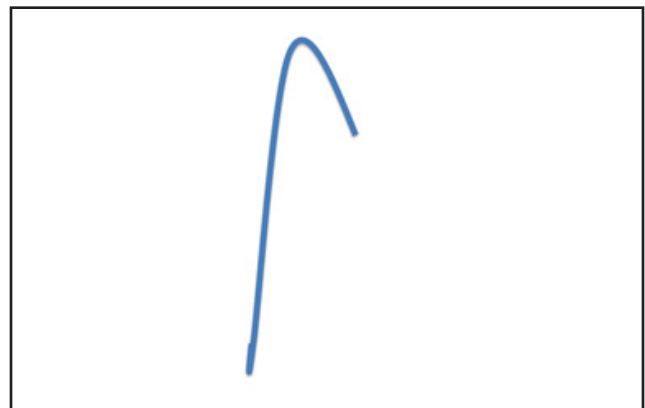
Figure 1. Example of divergent-exploratory (abstract) object from Evaluation of Potential Creativity assessment.

For the convergent-integrative tasks, we showed students one image of a set of eight different and unrelated abstract shapes and one image of a set of eight different