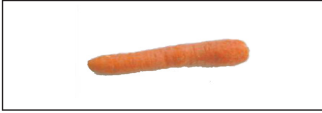
Figure 2. Example of divergent-exploratory (concrete) object from Evaluation of Potential Creativity assessment.

and unrelated concrete objects. Each child was asked to complete two drawings: one drawing using the eight abstract shapes and one drawing using the eight concrete shapes. We then asked the students to tell the story behind each drawing, and scored the students on a 7-point scale for each drawing based on detailed EPoC guidelines, with 1 the lowest score and 7 the highest. See Figure 3 for an example of a drawing that received the lowest score of 1 on the convergent-integrative task using concrete objects. See Figure 4 for an example of a drawing that received a 7, the highest possible score, on the same task.