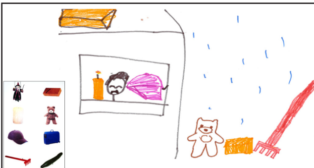
Figure 4. Example of high-scoring convergent-integrative (concrete) task from Evaluation of Potential Creativity assessment.

used all eight elements, the ways in which elements were combined in new and creative ways, whether the drawing was meaningful, and the originality of the idea being expressed. Participants' divergent-exploratory and convergent-integrative scores were not based on their craftsmanship or technical drawing ability. Two trained evaluators blindly scored each of the 148 convergent-integrative abstract drawings and 124 convergent-integrative concrete drawings. The average of the two scores for both the abstract and concrete drawings constituted the students' total scores on these two assessments. Using a weighted interrater-reliability procedure, we found that the ratings from the two coders produced a kappa statistic of .65 on the abstract drawings. This was considered a substantial level of agreement (Landis & Koch, 1977). For the concrete drawings, kappa was .58, a moderate level of agreement (Landis & Koch, 1977). A summary of the four parts of the EPoC assessment is presented in Table 1. 2