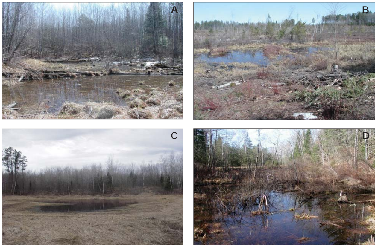
Figure 2. Of the four ponds, three are long-cycle, spring filling ponds: (A) Pond 18, predominantly open water, surface water and precipitation fed, (B) Pond 5, partially shaded to open, shallow sedge meadow, (C) Pond 23, predominantly open water, groundwater fed, while Pond 2 (D) is semi-permanent neighboring a stream.

Mean pond surface area and water depth did not change across years for Pond 18 (surface area: F = 0.06 , df = 1, 4 , P = 0.81 ; water depth: F = 1.01 , df = 1, 4 , P = 0.91 ) or Pond 5 (surface area: F = 1.3 , df = 1, 4 , P = 0.31 ; water depth: F = 0.65 , df = 1, 4 , P = 0.46 ). Pond 18 had a mean surface area of 401.7 m 2 (SE = 107.3 m 2 ) and mean water depth of 0.27 m (SE = 0.07 m) while Pond 5 had a mean surface area of 678.5 m 2 (SE = 31.9 m 2 ) and mean water depth of 0.23 m (SE = 0.01 m) (Table 1). Pond surface area and water depth decreased over time for Pond 2 (surface area: slope = -35.25, F = 14.85 , df = 1, 4 , P = 0.02 ; water depth: slope = -0.02, F = 19.47 , df = 1, 4 , P = 0.01 ), and Pond 23 (surface area: slope = -115.07, F = 12.37 , df = 1, 4 , P = 0.02 ; water depth: slope = -0.03, F = 8.14 , df = 1, 4 , P = 0.05 ). In the 1990s, Pond 2 had a mean surface area of 1645.3