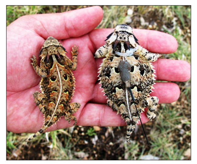
Figure 2. Two Texas Horned Lizards ( Phrynosoma cornutum ) encountered during this study at Blue Mountain Peak Ranch. The individual on the right has been equipped with a radio transmitter.

Between 2007 and 2010 lizards from both sites were fitted with radio transmitters (Wildlife Materials SOPB-2070: 2007-2009, Holohil BD-2: 2008-2009, and ATS R1645/R1655: 2010; Fig. 2). Seventeen lizards (seven males and ten females) and nineteen lizards (nine males and ten females) were telemetered from Camp Bowie and Blue Mountain Peak Ranch, respectively. Transmitters were attached between the shoulder blades using clear silicone. To avoid loss of the transmitter when the lizard molts, we secured a zip tie collar around the lizard's neck and attached the transmitter to this collar with fishing line. In order to better camouflage the telemetered lizard, additional silicone was spread around the remaining exposed area of the transmitter and covered with native soil. The average weight for the transmitter assembly from 2009 and 2010 was 6.6 \pm 2.4% (range -3.2-13.1%) of the lizard's body weight at time of capture (Knapp and Abarca 2009; Mougey 2009). We relocated lizards using a hand-held receiver (Telemetry Receiver