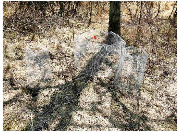
Figure 1. Tubular enclosures made of hardware cloth erected around crayfish burrows where radio-tracked massasaugas were known to have entered brumation so that they could be recaptured during emergence after radiotransmitter batteries had expired.

Burchard Lake is a 263 ha property that is accessible to