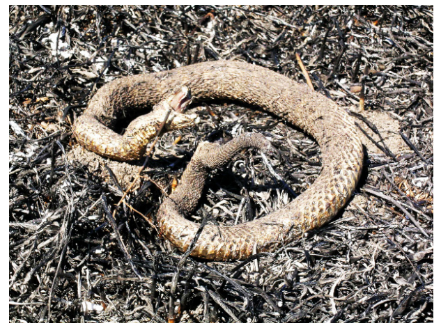
Figure 3. One of four adult Western Massasaugas found burned after a prescribed fire on 1 April 2004.