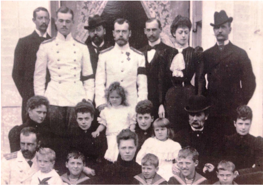
Nicholas II (center) and his wife Alexandra Fedorovna (seated at left, and Maria Fedorovna (neé Dagmar of Denmark) at lower right, among other “royals” in 1906.

He writes of visiting the Tretyakov, recalling the many works by Vasilii Vereshchagin (1842–1904) that he saw when they were exhibited in the Cyclorama Building in Boston in the 1880s (the exhibition at the Arena actually opened in October 1890). 26