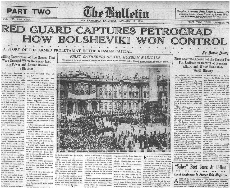
Figure 3. A section cover of the Bulletin, 19 January 1918, with Beatty's report and analysis of the Bolsheviks' seizure of power in October 1917.

as was Petrograd, in the realization that with their surrender the dictatorship of the proletariat had become fact.