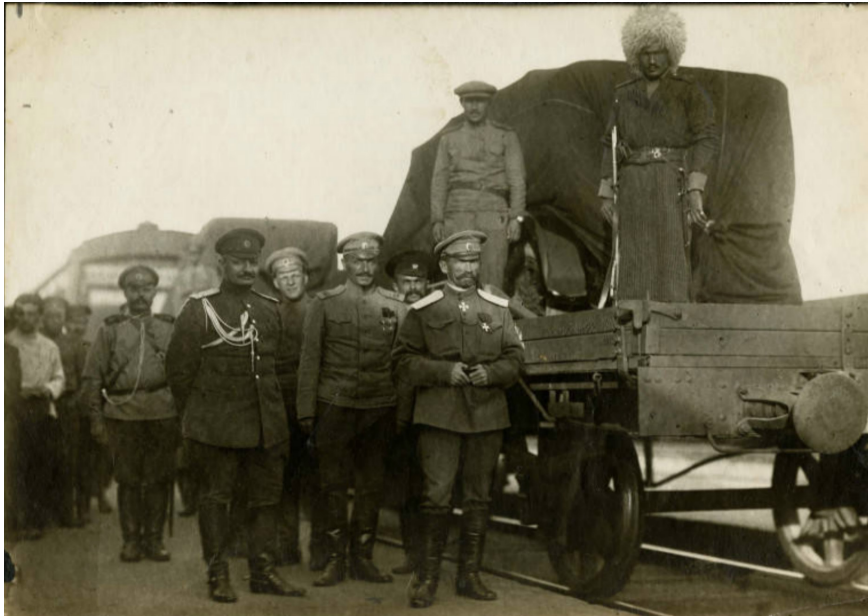
Figure 2. L. G. Kornilov, his staff and Cossack from the “Wild Division”, from Bessie Beatty, The Red Heart of Russia (New York: Century Co, 1918), 172.

ate Overman Committee in the spring of 1919, it would be an oversimplification to suggest that Beatty was an ardent hard-shell supporter of the Soviet regime. Rather she came to resent the escalation of public anxiety and frenzy, as well as demonization of the liberal ideas of revolutionaries and Russians themselves, evoked by the hearing. She never claimed she was partisan “in her feelings or in sympathies” with the Bolsheviks. Responding to Senator Overman, she stated: “I’m merely an observer of Russian affairs. My feeling is that we ought to understand what produced the Bolsheviks, what they are trying to do, what there is that is good about them, and what there is that is bad.” 51 During the July Days, when “Petrograd [lay] terrified and trembling in the hollow of the Bolsheviks hand,” 52 she produced a reprehensible image of the Bolsheviks as “the party of chains,” whose roots were “buried deep down in the black past of Russia.” 53 She urged that they be distinguished from the Council of Workmen’s and Soldiers’ deputies and the masses, describing the Bolsheviks as “pitiful little fellows, with just enough ignorance, just enough idealism, just enough knowledge of the catchwords of economics” to miraculously defeat “every other power in Russia” in practically no time. 54 As the culmination of the ultimate political and social upheaval of un-