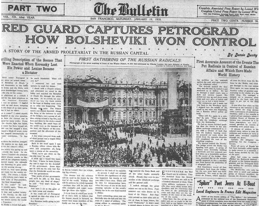
Figure 3. A section cover of the Bulletin, 19 January 1918, with Beatty's report and analysis of the Bolsheviks' seizure of power in October 1917.

as was Petrograd, in the realization that with their surrender the dictatorship of the proletariat had become fact.