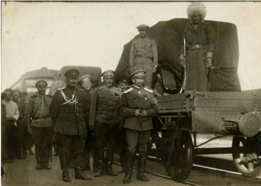
Figure 2. L. G. Kornilov, his staff and Cossack from the “Wild Division”, from Bessie Beatty, The Red Heart of Russia (New York: Century Co, 1918), 172.