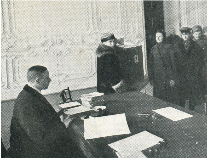
Figure 4. New Russia votes for the Constituent Assembly, from Bessie Beatty, The Red Heart of Russia (New York: Century Co, 1918), 401.

As Beatty was leaving Russia on 26 January 1918, she saw the apprehension in people’s eyes and felt that “tragedy was in the air.” 62 She anticipated devastating consequences of one-party monopoly on power, predicting the imminent terror. As Petrograd, “wrapped in the gray morning mist,” gradually slipped from view, it seemed that “Russia, which had touched the heights and the depths, had at that moment found the bottom of her cup of misery.” That day, she knew that Russia “had only begun to suffer.” 63