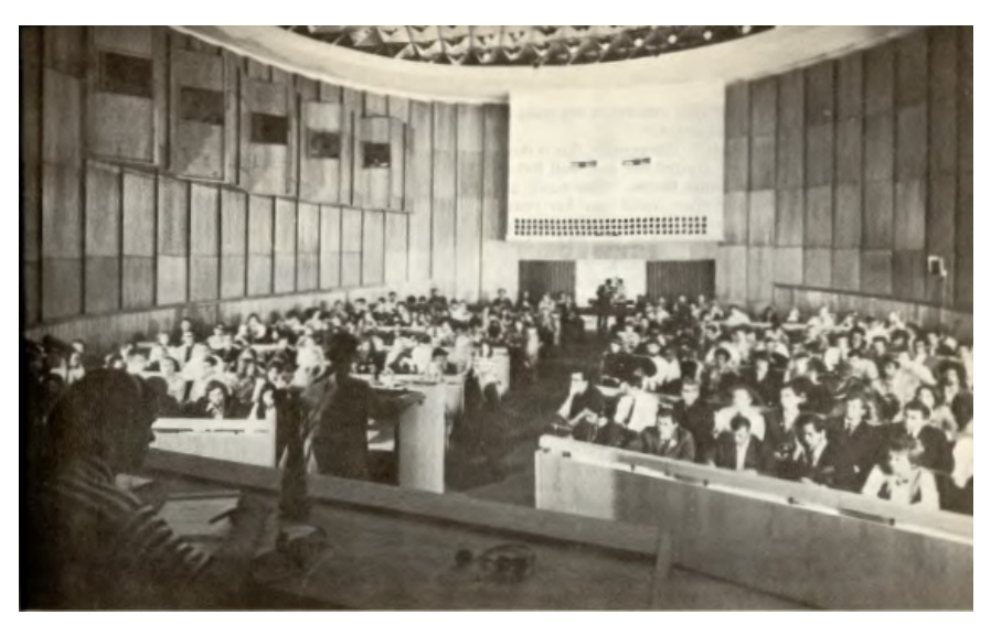
Plenary Session at the 1974 Soviet-American Youth Conference in Baku, from Their Point of View: Young Americans in the USSR, Moscow: Progress Publishers, 1977.

Many of the Americans, by contrast, took the conference as an opportunity to explore a foreign country, to have fun, and socialize with a group of people they had only read or heard stories about. The Soviet side, made up of Party and Komsomol members, saw the conference as an extension of their Party work.<sup>14</sup> Their formal and carefully prepared presentations and the tightly organized structure of the conference came off poorly at times.<sup>15</sup> "Cold and dry, and definitely too long," according to one American.<sup>16</sup> Spontaneity was never the name of the game at Soviet-hosted or sponsored conferences. The Komsomol ran a tight ship at such events with "boring, pro-forma speeches" dominating the agendas, even at events held beyond Soviet borders such as the 1968 World Youth Festival in Sofia. Objections, deviations, and protests were frowned upon and shut down. <sup>17</sup>