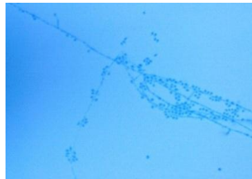
Lactophenol cotton blue stain from the above colony: Sporothrix schenckii