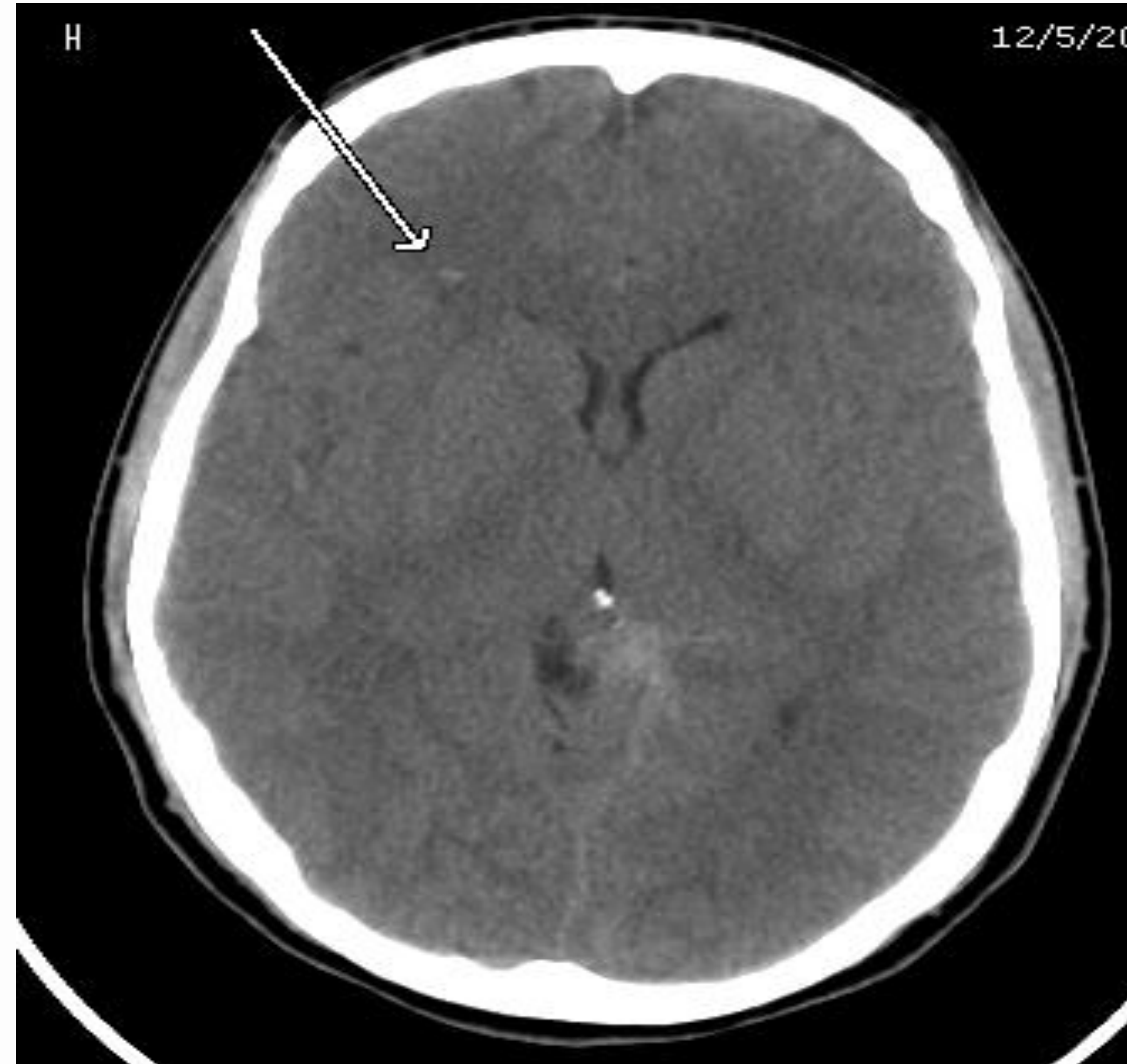
CT scan depicts the patient's left cerebral SAH and right petechial hemorrhage (arrow).

On day #3 of admission, he developed acute respiratory failure, requiring intubation, and decreased consciousness and confusion. Chest x-ray displayed pulmonary edema. There was a 4/6 systolic murmur on cardiac exam. Echocardiogram revealed a mitral vegetation with severe holo-systolic insufficiency. Blood cultures were positive for Group B Streptococcus. Thus it seems most likely that the patient developed a mycotic aneurysm from septic emboli resulting in his SAH. He was started on IV antibiotics and received an artificial valve. He did well post-op and was discharged to home in fair condition.