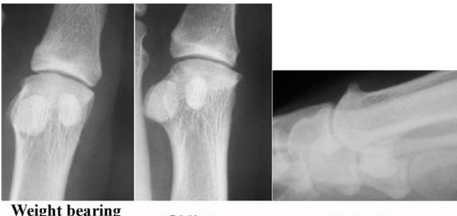
Weight bearing AP Oblique Lateral

Figure 2. Radiographs demonstrating good agreement case for Grade 3 hallux rigidus.