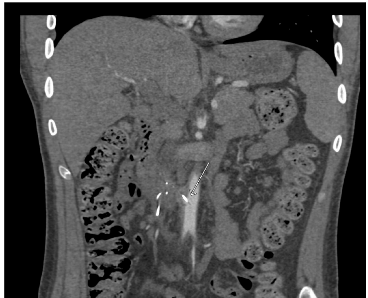
Figure 1. CT angiogram, coronal view, showing a strut penetrating the wall of the aorta.

Vascular surgery recommended that the patient be transferred to a higher level of care for aortic and inferior vena cava reconstruction. Prior to transferring, the patient became acutely hypotensive, diaphoretic, and exhibited a decreased level of consciousness. He was taken to the operating room for emergent abdominal endovascular aortic repair (EVAR), after which he remained hemodynamically stable. He was transferred to another facility for excision of the pseudoaneurysm and graft placement.