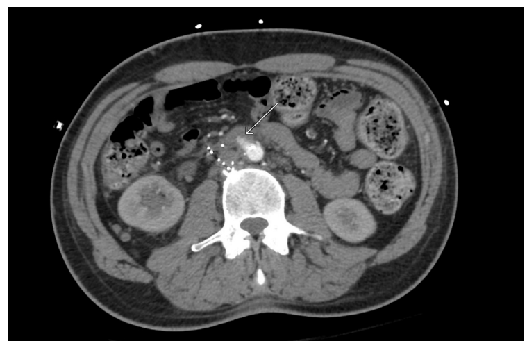
Figure 3. CT angiogram, axial view, showing an aortic pseudoaneurysm projecting into the wall of the third portion of the duodenum.