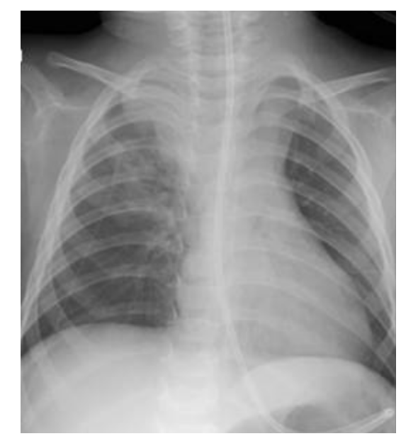
Figure 1. CXR with diminished lung volumes and a consolidative medial right upper lobe opacity. Heart size and central vascularity within normal limits. A prominent thymic shadow is evident.

In the pediatric ED, he was noted to have dyspnea and stridor with sudden desaturation, along with seizure-like activity, including clenching of his jaws. He was given lorazepam for seizure-like activity. He continued to receive supplemental oxygen via placement of oral airway for airway protection. He required intubation by direct laryngoscopy following an episode of emesis associated with desaturation. He was admitted to the pediatric intensive care unit (PICU), where septic workup was completed with chest x-ray (CXR) showing a right patchy opacity, negative blood cultures, and negative respiratory viral panel. He was started on intravenous (IV) dexamethasone and IV ceftriaxone. A diagnosis of febrile seizures was made after an electroencephalogram showed no evidence of focal or epileptiform abnormalities. A repeat CXR showed diminished lung volumes with a consolidative medial right upper lobe opacity. Heart size and central vascularity were within normal limits but a prominent thymic shadow was seen (Figure 1).