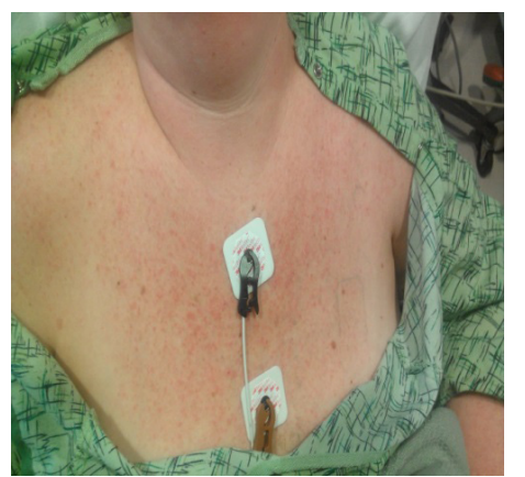
Figure 1. A v-shaped, photo-distributed erythematous area with scaly papules on the anterior chest.

seen in dermatomyositis, but the patient had no muscle weakness, Gottron's papules, and heliotrope rash on physical examination and her CPK, aldolase and anti Jo were negative.