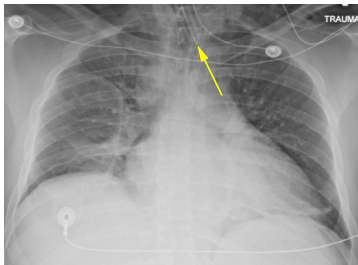
Figure 1. Chest x-ray depicts the ET tube placement.

x-ray showing the ET tube projecting over the trachea, but the tip appeared to be lateral to the tracheal lumen.