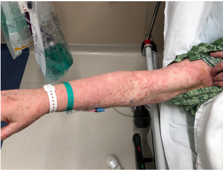
Figure 4. Rash of the arm.