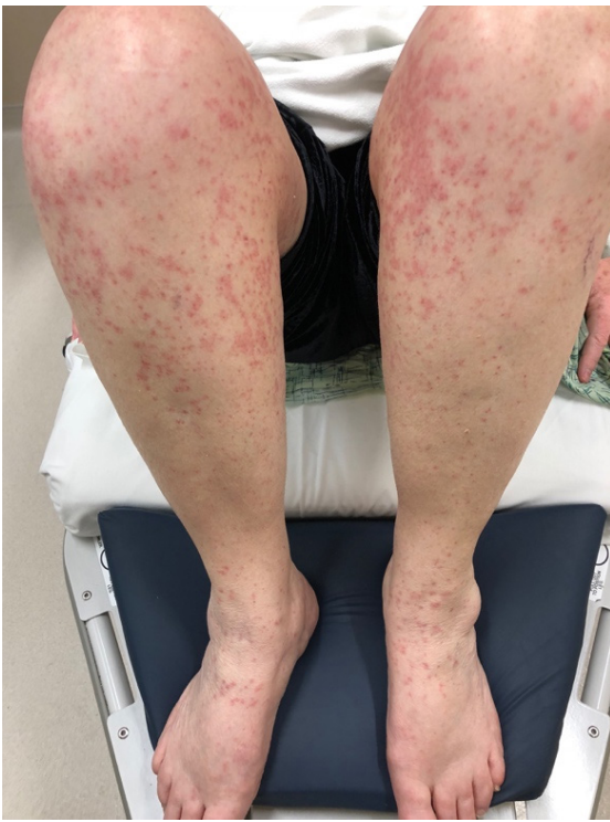
Figure 3. Rash of the leg.