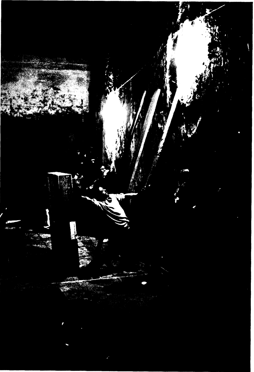
Isis y Osiris de Carlos Cueva. XV Muestra Nacional de Teatro Peruano. Qosqo, Perú.