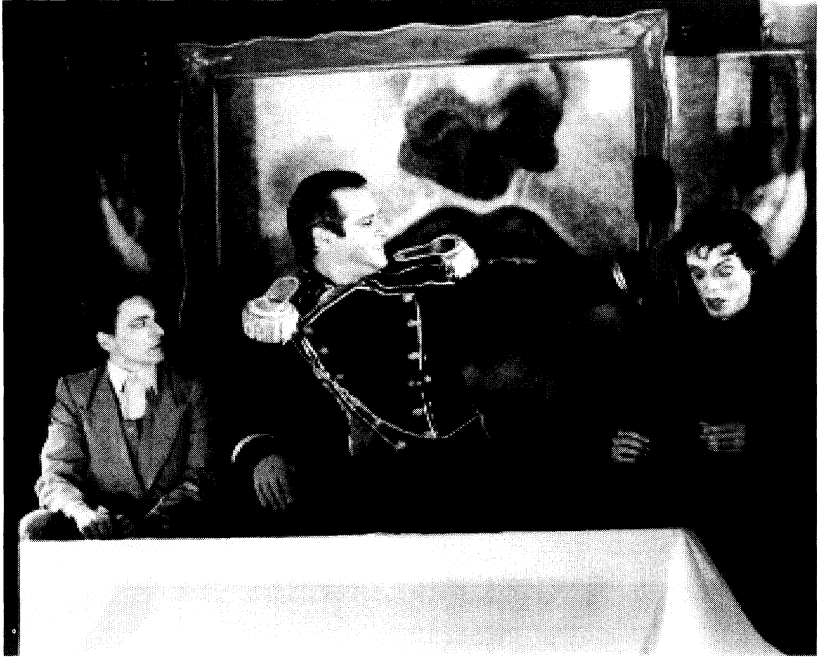
Calígula in the Teatro Trianón.