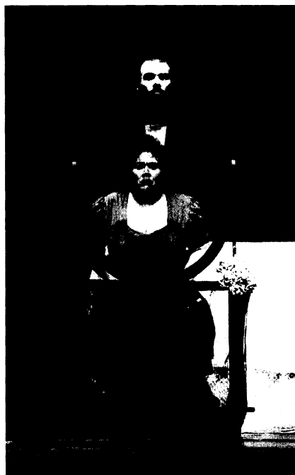
Álbum de Família Grupo Galpão