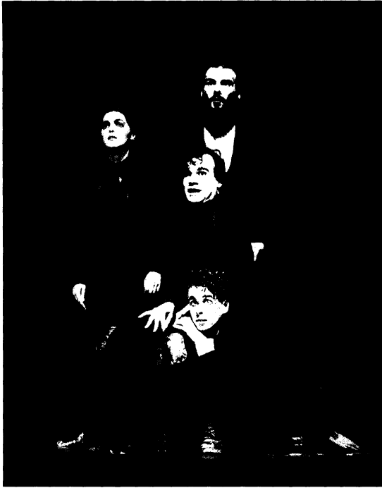
Álbum de Família Grupo Galpão