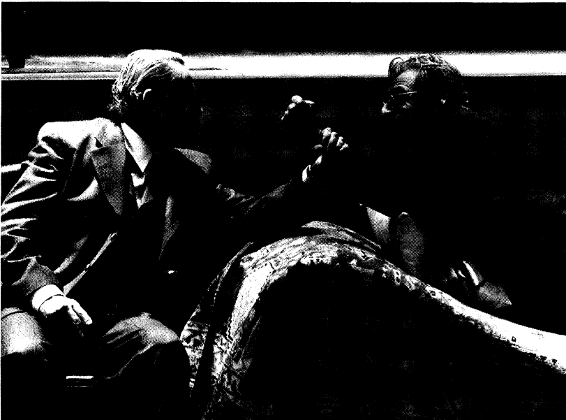
La moneda de oro: Freud o Jung?