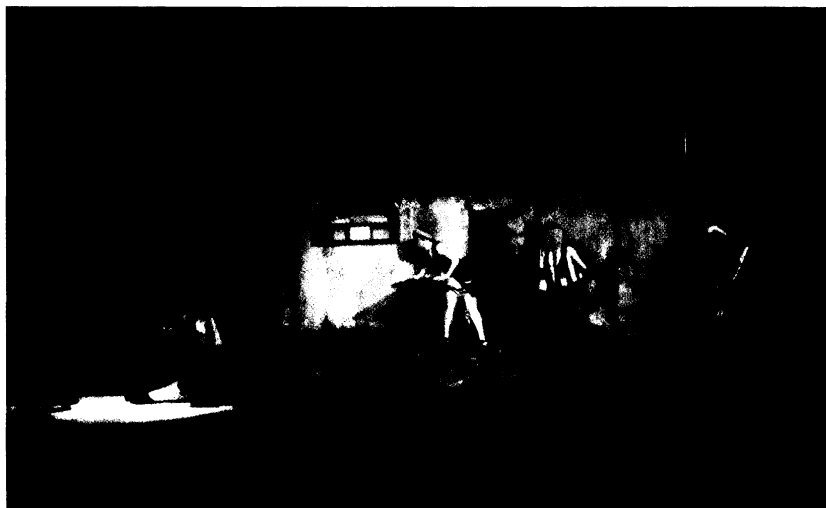
La honesta persona de Sechuán . Foto: Dana Giampaolo