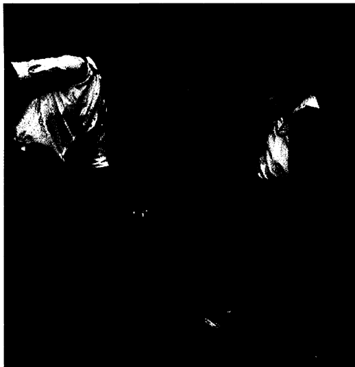
Muerte accidental de un anarkista.