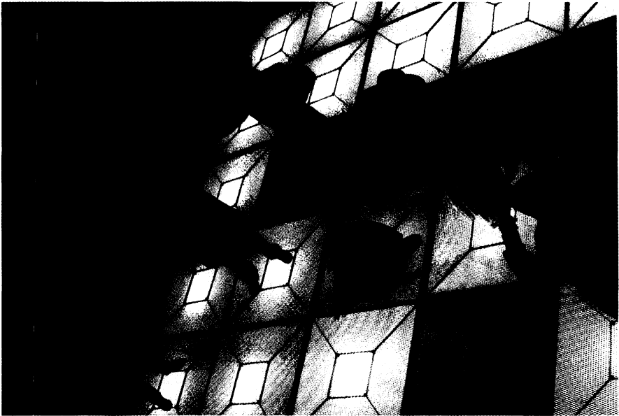
¡PAAH!: Otra fábula sombría.