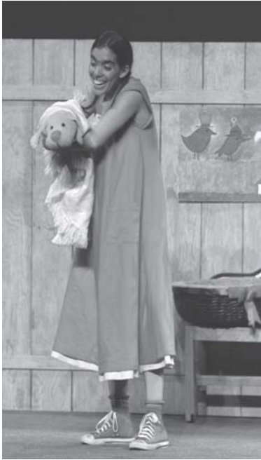
Adiós, querido cuco.

It seems that almost every year teatristas express concerns about a dearth of good theatre in Mexico City, and this year was no exception. But as happens with almost as much frequency, I found in Mexico City's spring 2007 theatre season plenty to praise. Not all of its 100 plus plays were excellent or even good theatre, but the upper tier was top-notch.