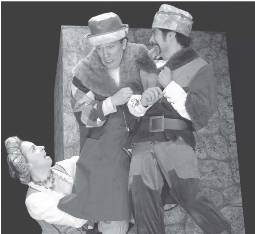
La comedia de las equivocaciones.