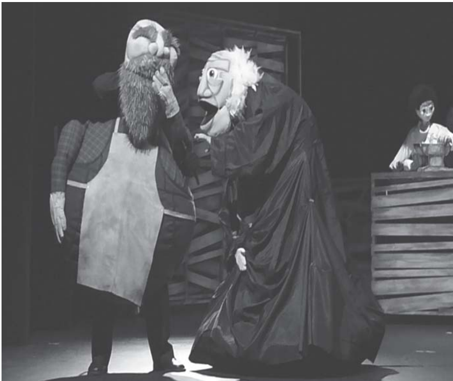
De la oreja al corazón.