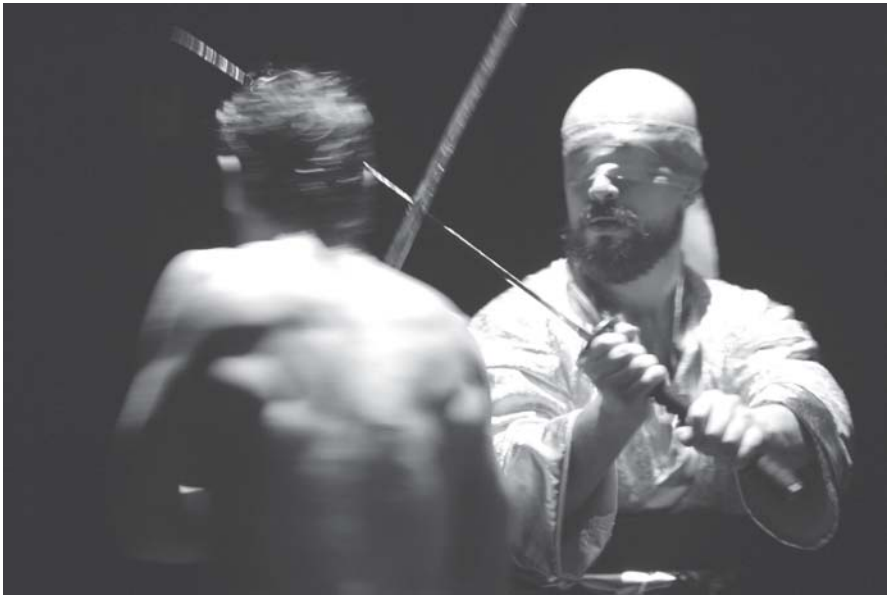
Vencer and Sensei.