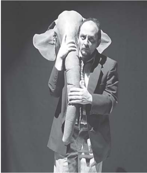
Historias de animales.